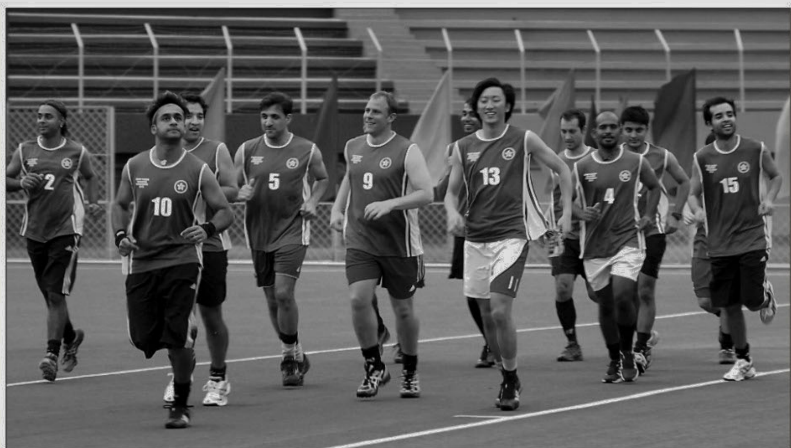
Members of Hong Kong team, who will take part in the upcoming Asian Games Qualifying Tournament, jog during a practice session at the Maulana Bhasani Hockey Stadium yesterday.