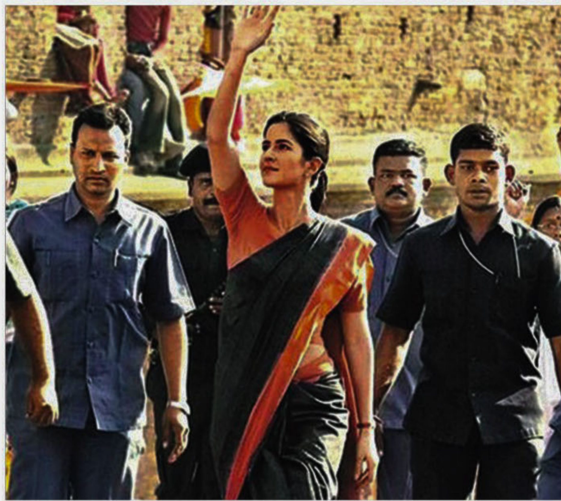
Katrina Kaif in "Rajneeti".

Katrina's denial notwithstanding, the media has not stopped finding similarities between her role in Jha's political thriller and Priyanka and some even juxtaposed the photos of the two ladies.