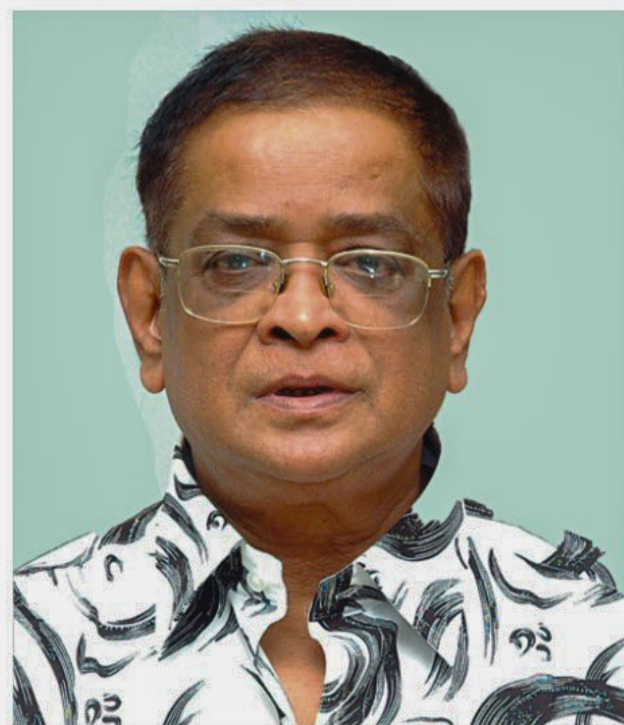
He is also a judge on the "Khudey Gaanraaj" (aired talent hunt for children, on Channel i).

Apart from this single-episode play, Humayun Ahmed is busy with his new film "Ghetu Putra Kamola".