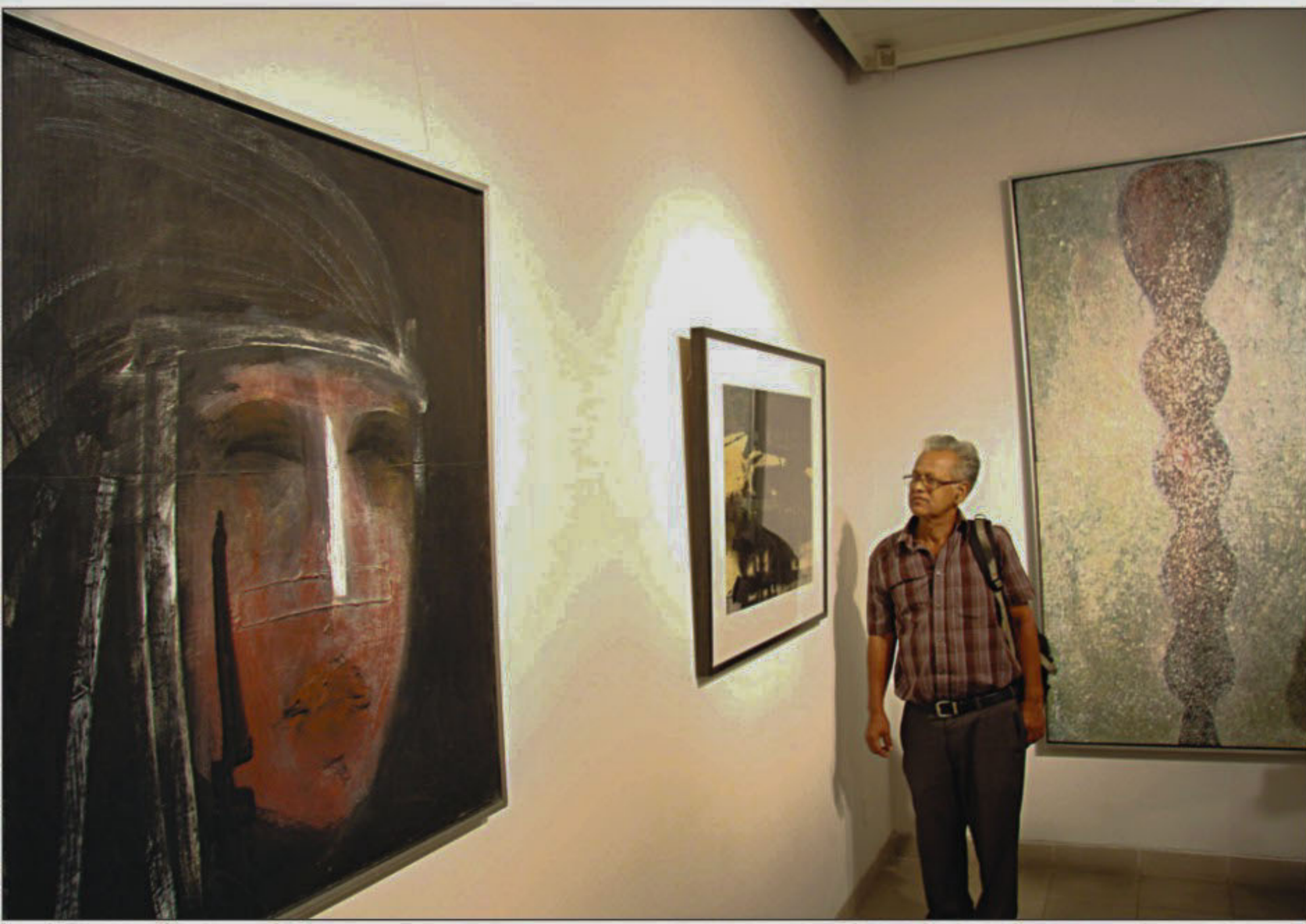
A 12-day exhibition of artworks by artist Hamiduzzaman Khan begins at Bengal Gallery in the city today.