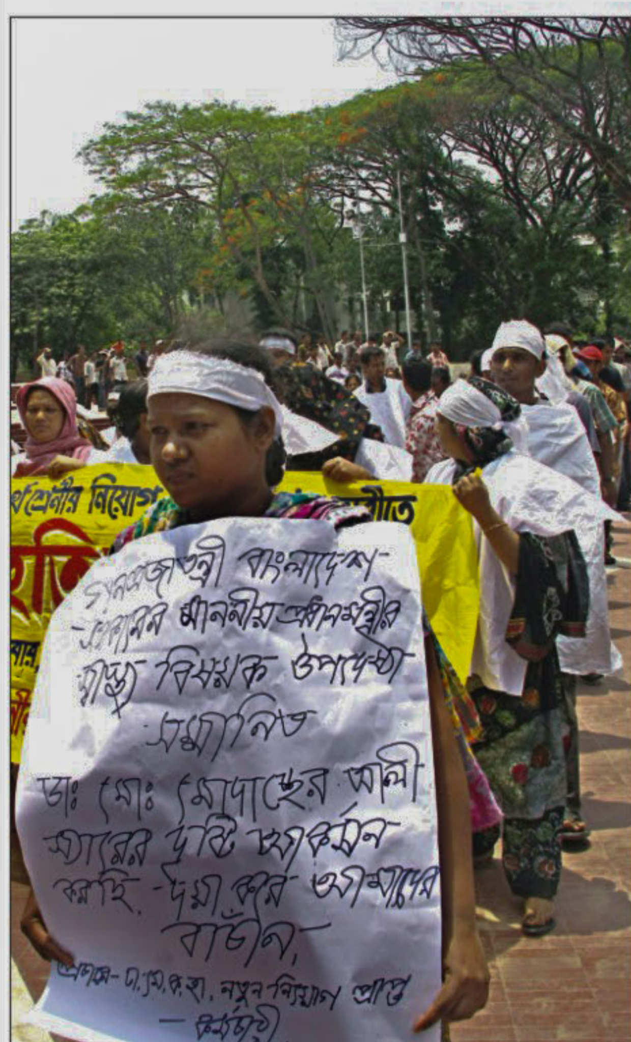
Covering themselves in shrouds, the third and fourth class employees of Dhaka Medical College and Hospital take out a procession from the Central Shaheed Minar in the city yesterday demanding their temporary recruitment be made permanent. (Story on Page 16)