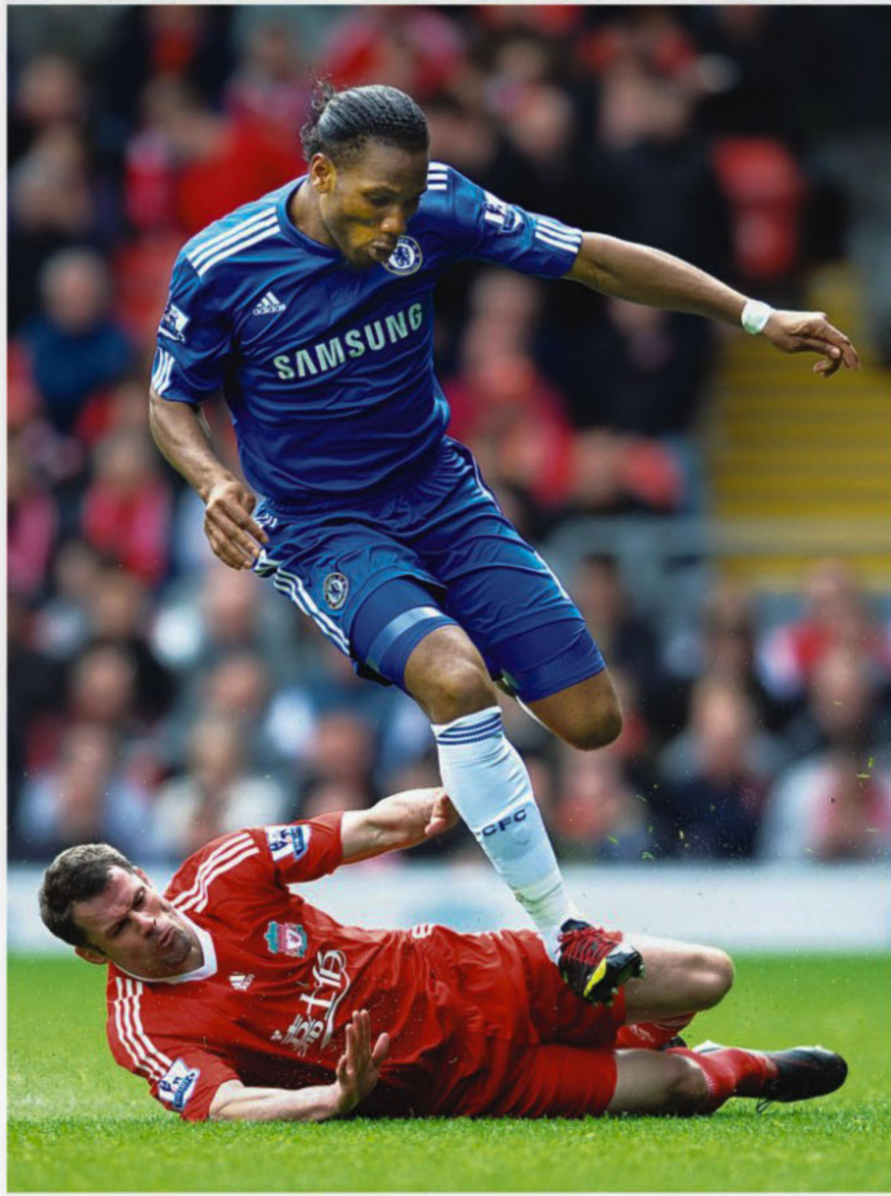
CROSSING THE ANFIELD HURDLE: Chelsea striker Didier Drogba hurdles the challenge of Liverpool defender Jamie Carragher during their Premier League match at Anfield yesterday.

Salomon Kalou and Nicolas Anelka, it was Liverpool who came closest to breaking the deadlock in the opening exchanges as Alberto Aquilani went close to delivering a crushing blow to Ancelotti with a cracking 25-yard effort that clipped the top of the bar.