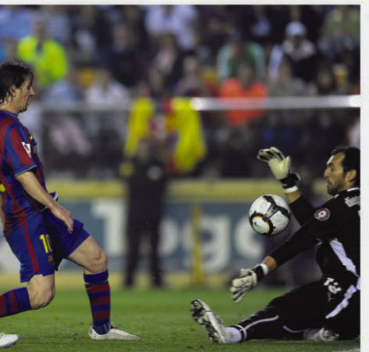
Barcelona forward Lionel Messi (C) lifts the ball over the Villarreal goalkeeper to score his second goal in their Primera Liga match at the El Madrigal on Saturday.