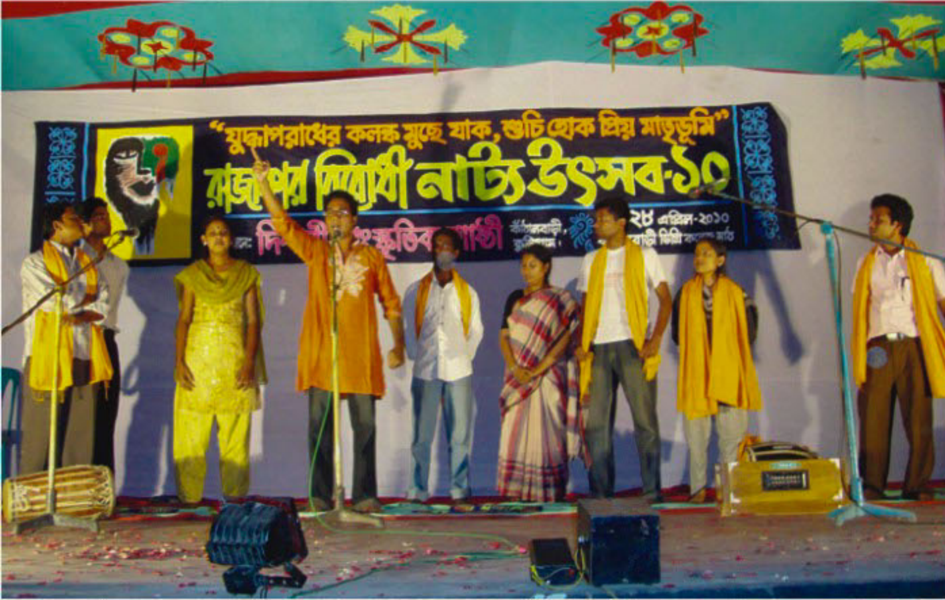
A scene from "Purono Pret".