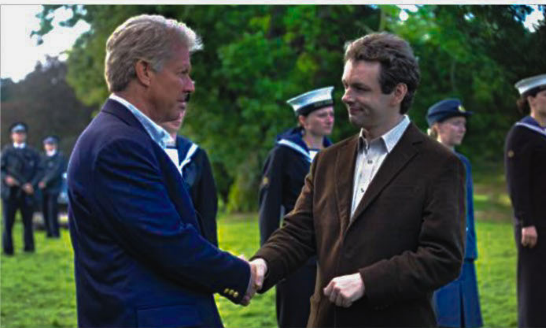
"The Special Relationship" looks at the bond formed between former US President Clinton (Dennis Quaid, left) and former British Prime Minister Tony Blair (Michael Sheen).