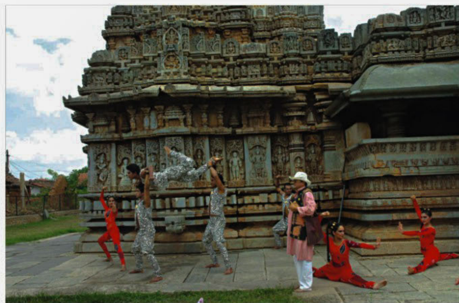
A scene from the film "Ijjodu".

Chennai, the heroine of "Ijjodu" (made in Kannada, the language of Karnataka, located in South India) is less