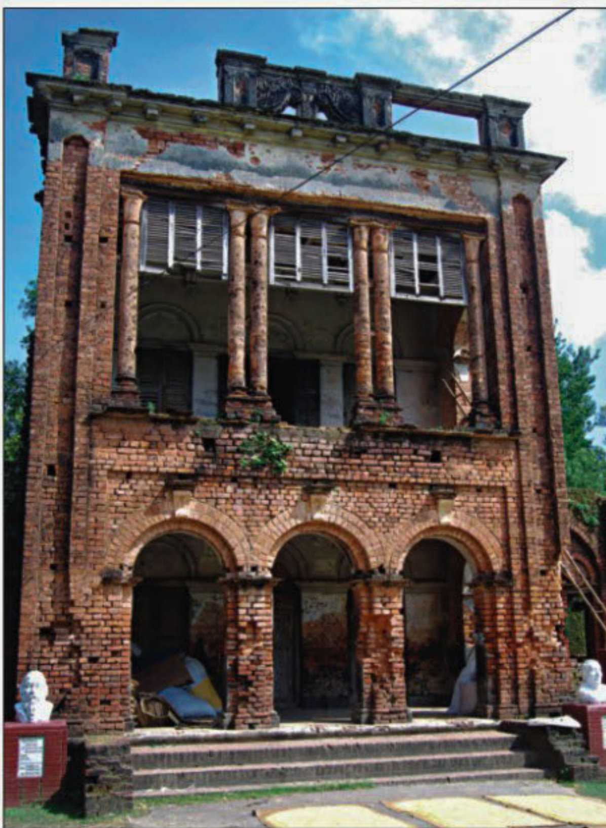
The facade of Tagore's father-in-law's residence at Dakkhindihi in Fultola upazila of Khulna district.

Locals from Shilaidaha Kuthibari and adjacent areas of Kumarkhali upazila in Kushtia destroyed many structures, including a chari-