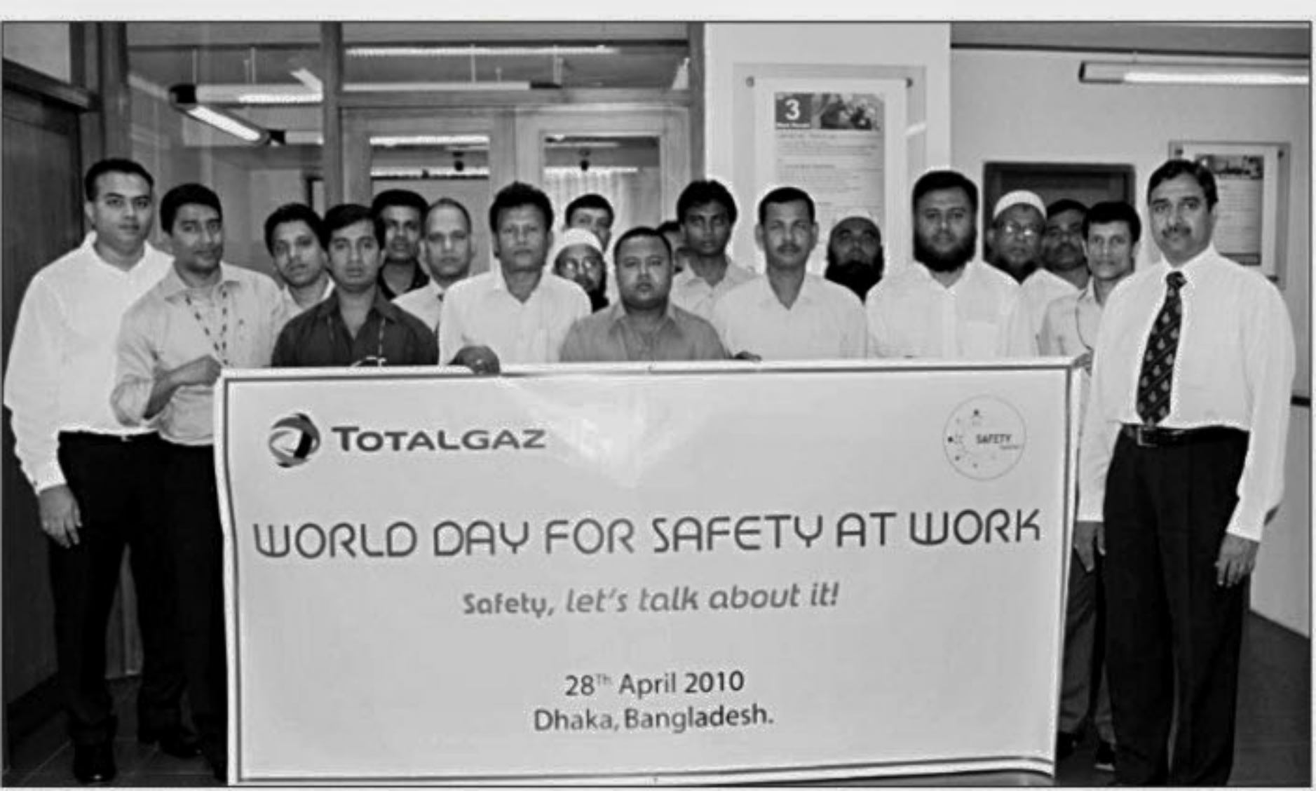
Employees and stakeholders of TOTALGAZ Bangladesh celebrate the company's worldwide safety awareness programme -- World Day for Safety at Work -- in Dhaka yesterday.

Praising the Bangladeshi workers employed in South Korea, he said they are industrious, sincere and law-abiding.