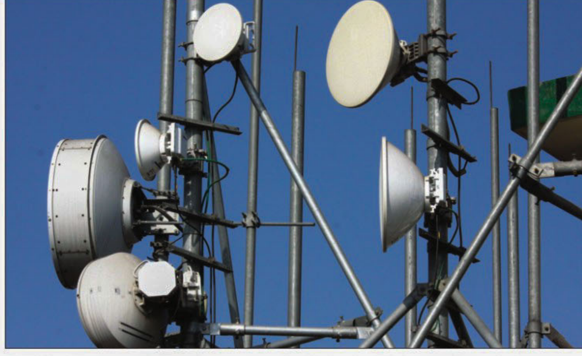
A mobile phone network tower looms across the Dhaka sky. Third-generation technology promises high-speed internet.

However, the market's top player, Grameenphone (GP), doubts the transparency