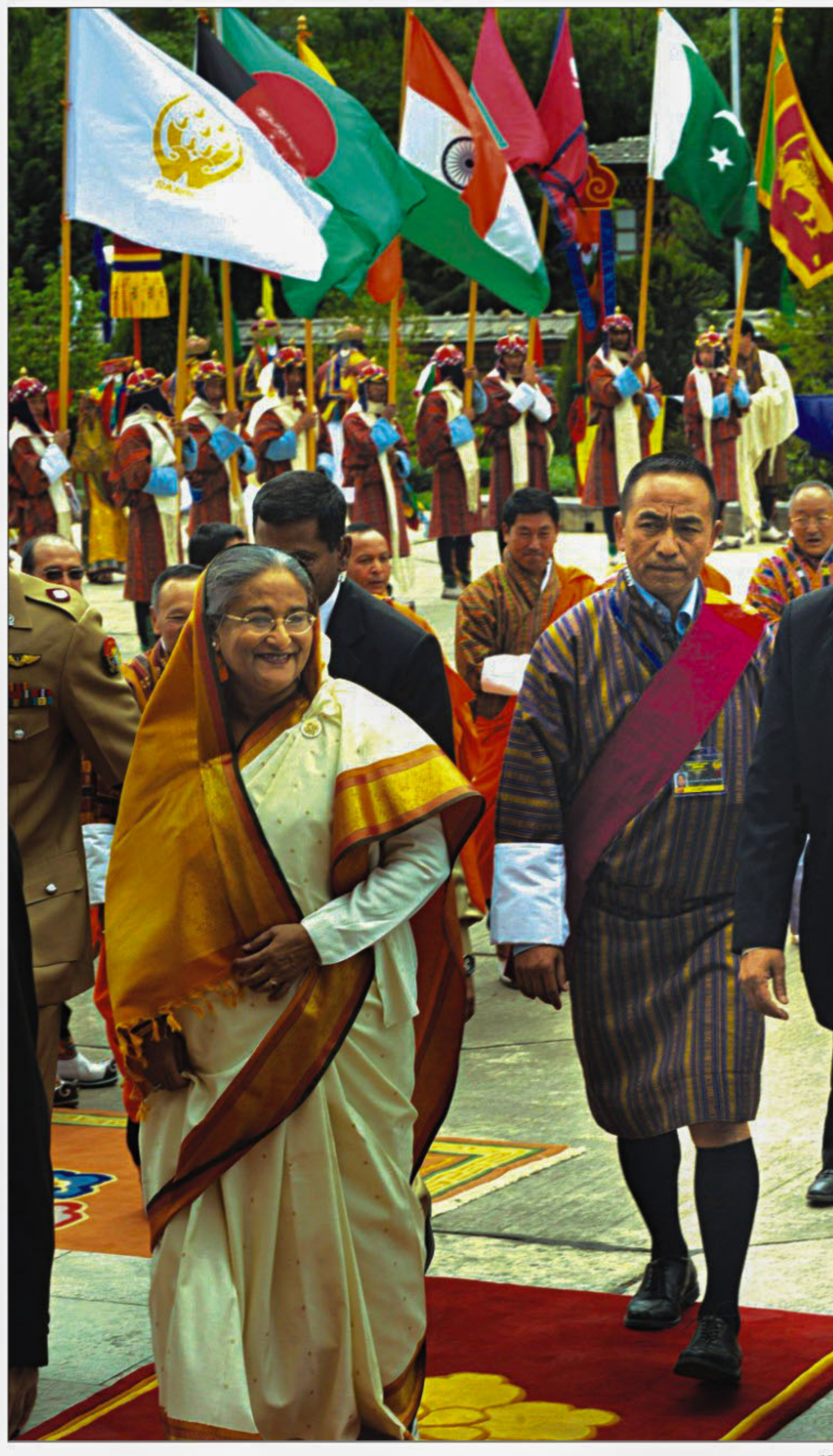
Prime Minister Sheikh Hasina arrives at the 16th South Asian Association for Regional Cooperation (Saarc) summit in Thimphu yesterday. Bhutan hosts the annual Saarc summit for the first time.

The Krishi Bank chairman said the government has distributed Agriculture Input Assistance Cards among 1.80 crore farmers.