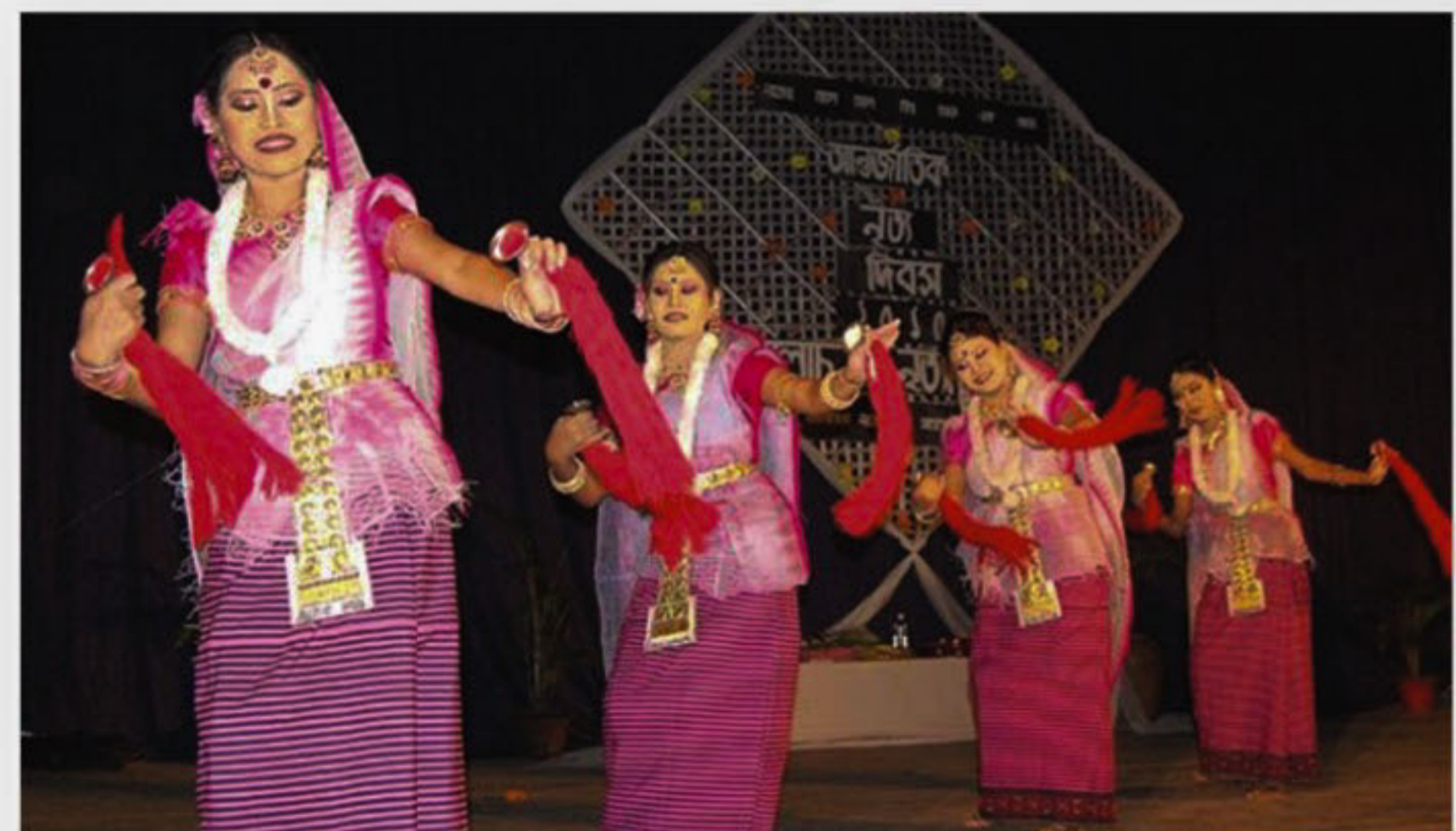
Artistes perform dance at the programme.

Group dances by Sylhet Nriyasholee, Nriya Rang, Shilpangan, Nriyasarang, Manipuri Art and Cultural Centre from Moulvibazar, Nriyangan from Srimangal and others from Fenchuganj, Habiganj enthralled the audience with 20 presentations. Through dance they presented themes like Baishakhi festivities, rice harvesting by rural folk, boat race, Liberation War and the Radha-Krishna love story.