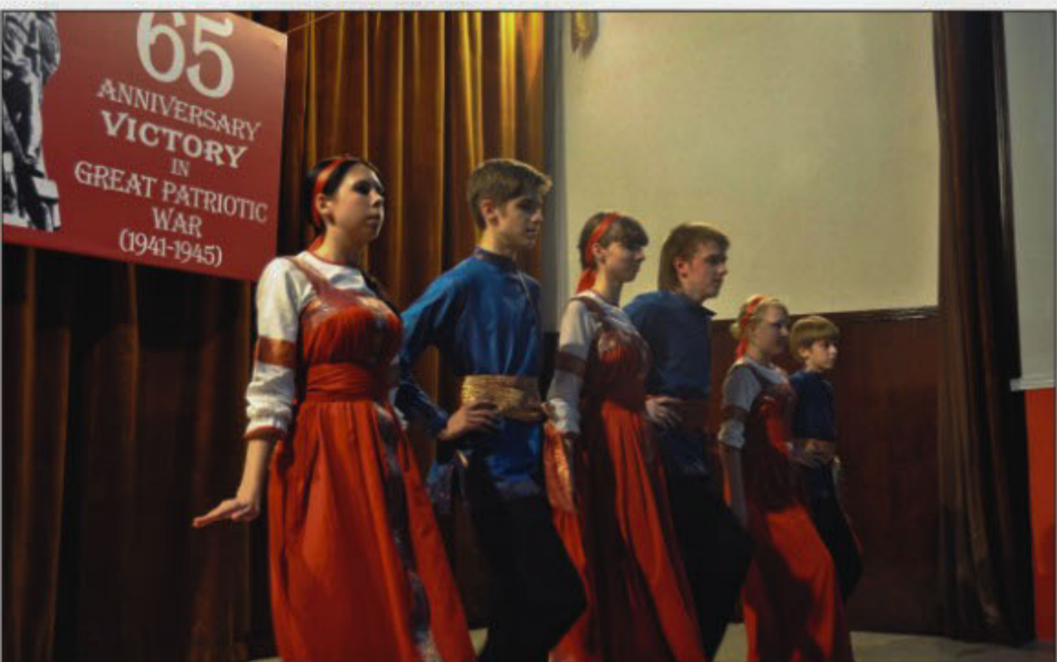
A cultural programme featured performances by students of Russian Embassy School in Dhaka.