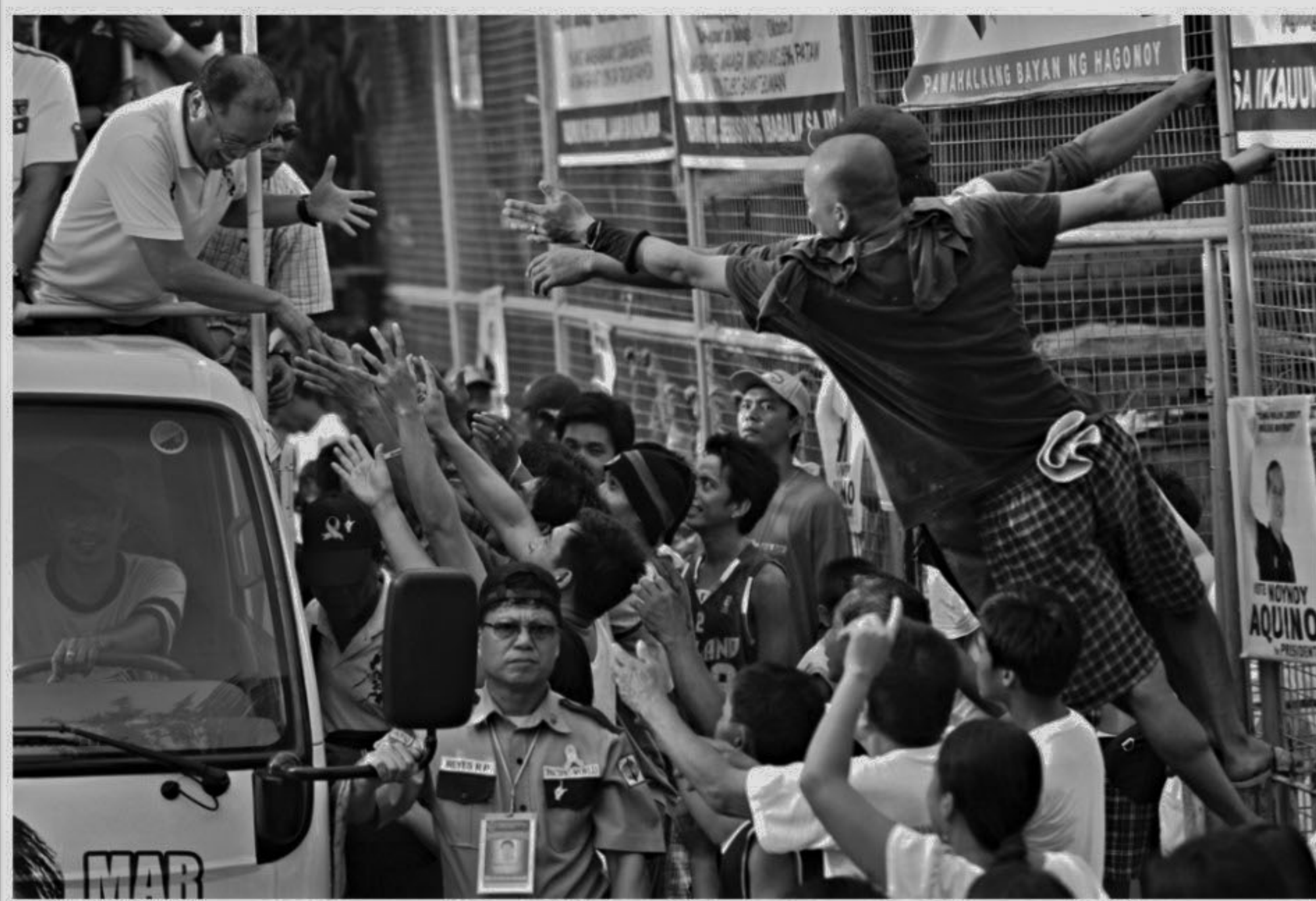
Liberal party presidential candidate Benigno Aquino distributes yellow balers during a campaign rally in the town of Calumpit, Bulacan province, north of Manila yesterday. Aquino in the latest surveys is the frontrunner to become the next Philippine president.

"The United States calls upon Iraq's leaders to set aside their differences, respect the courageous ballots of the Iraqi people, and to form quickly a government, that is inclusive and represents the will of all Iraqis," Hillary said in a statement.