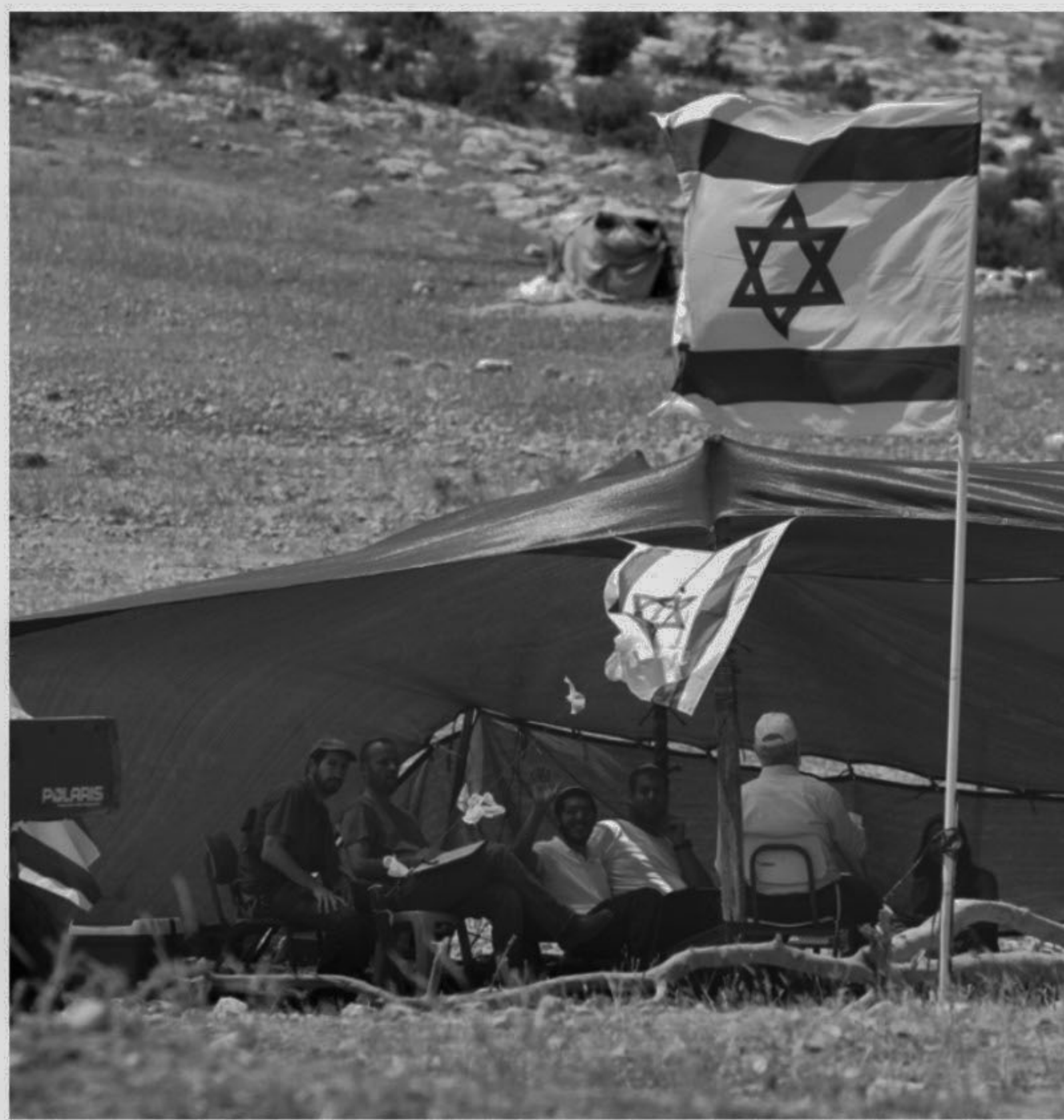
Israeli settlers sit inside a tent set up in Palestinian land in the occupied West Bank near the village of Tubas, south-east of Jenin yesterday. In the inset, US Defence Secretary Robert Gates (L) listens as Israeli Minister of Defence Ehud Barak (R) makes remarks at the Pentagon on Tuesday in Washington, DC.

He said he planned to meet with State Department officials on Wednesday.