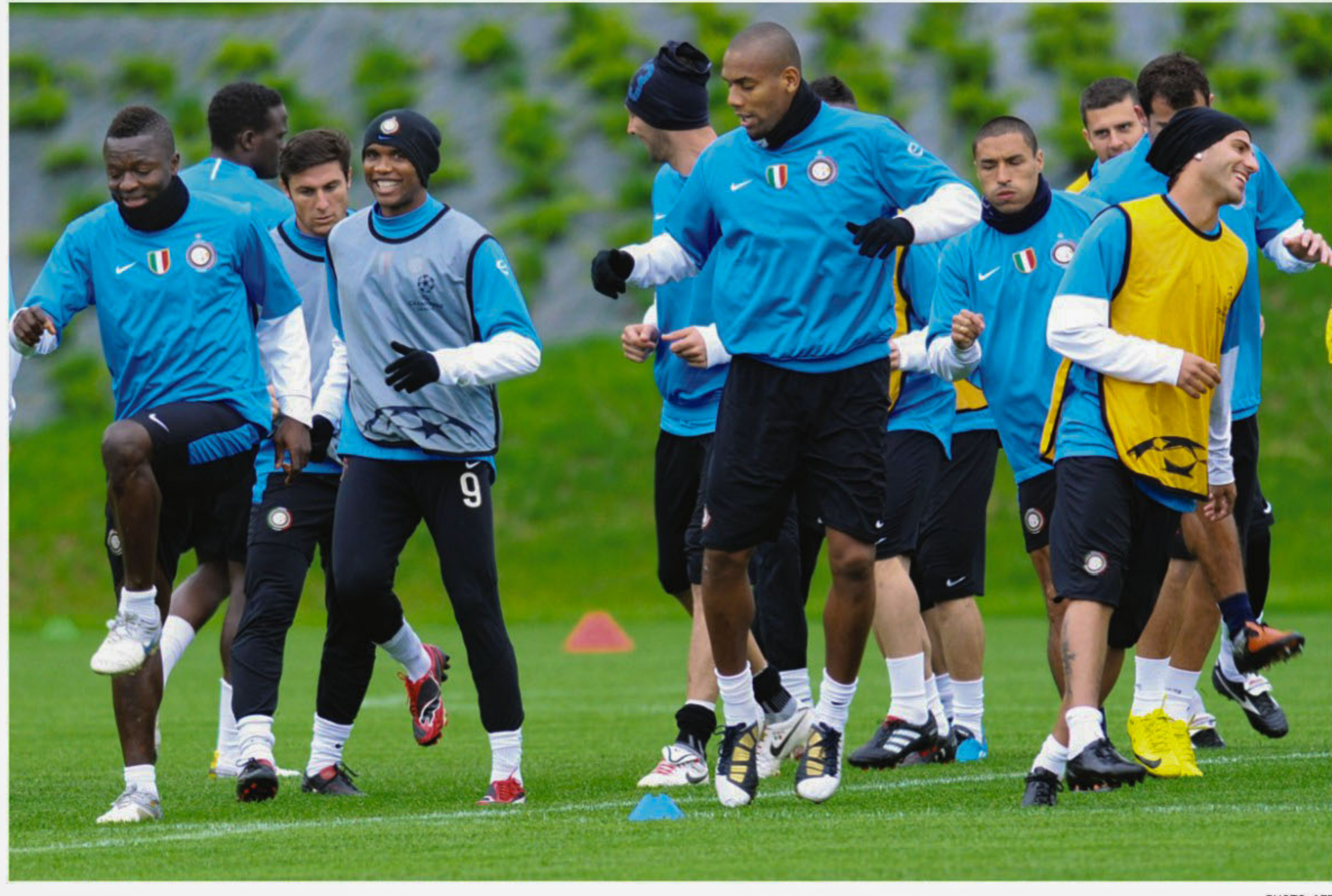
Inter Milan players warm up during a training session at La Pinetin in Appiano Gentile on Tuesday on the eve of their Champions League clash against Barcelona.