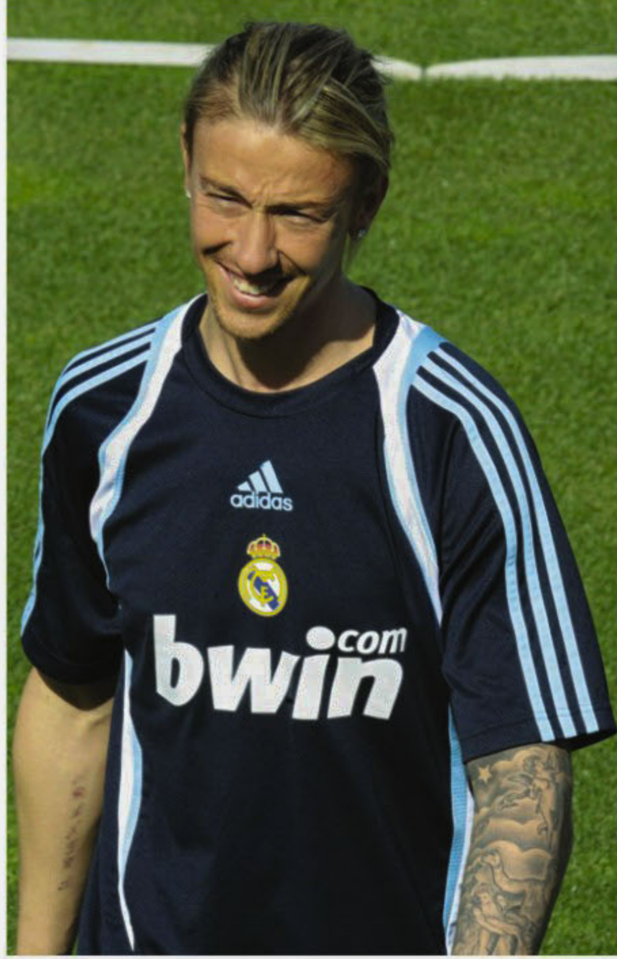
Real Madrid midfielder Guti smiles during a training session in Madrid on Tuesday.

Real Madrid's veteran midfielder Jose Maria Gutierrez, more commonly known as just "Guti," is to leave the club at the end of the season to wind down his career in Dubai, Onda Cero radio reported on Tuesday. "Guti has already signed his release from Real Madrid and will go to Dubai for two seasons for five million euros a season," the station said without mentioning any sources. Guti came through the ranks at Real and is currently vice-captain behind veteran striker Raul. He is one of the longest-serving members of the squad. Earlier this month the 33-year-old said he wanted to leave the Spanish giants for a move to England, Italy or the Middle East. "As it stands there is no possibility of staying. I have a year left (contract) but we hope to reach an agreement," he told Onda Madrid radio. He started his career at Real in December 1995, winning five La Liga, three Champions League and two Intercontinental Cup titles, as well as 13 caps with the Spanish national side.