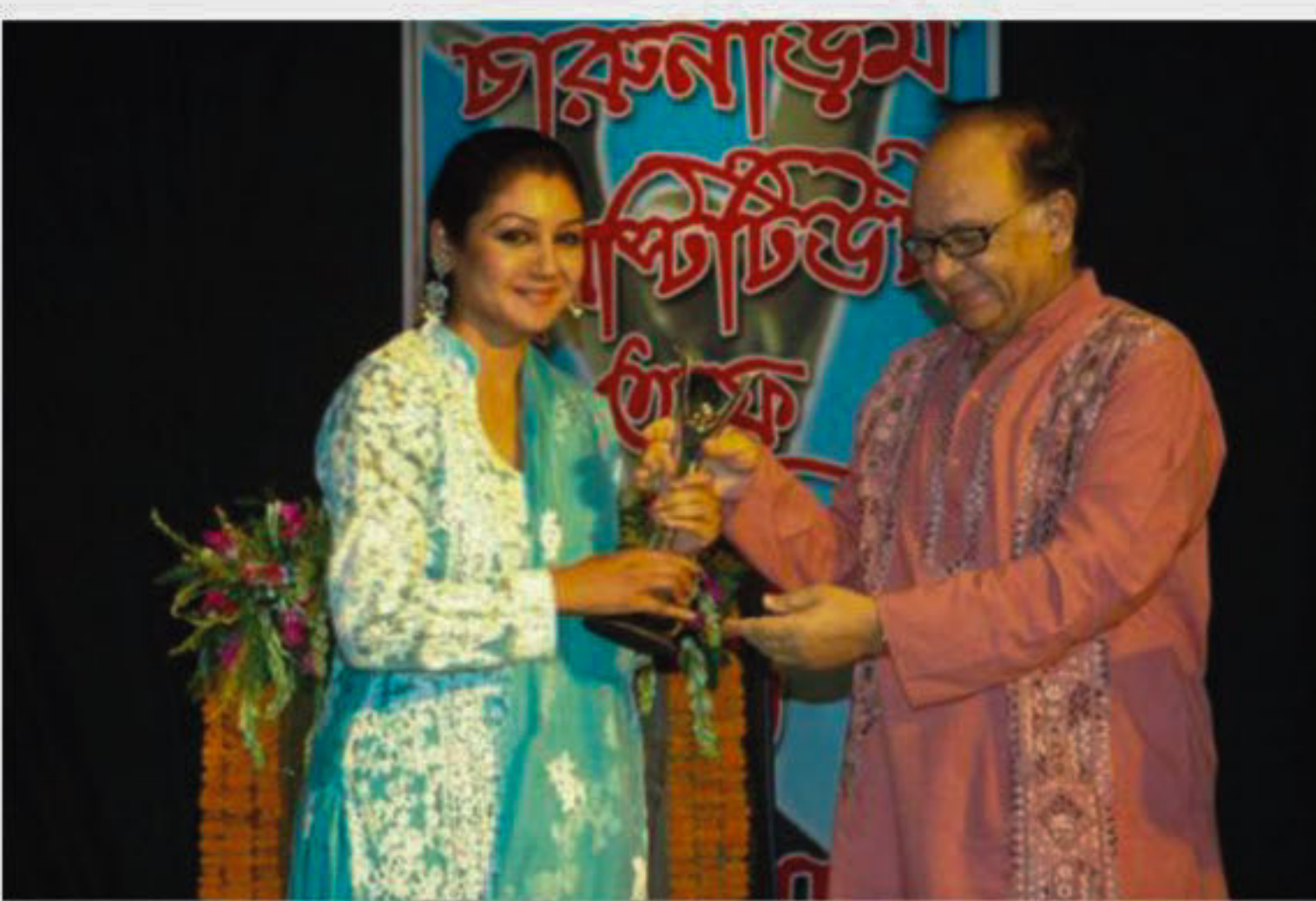
(From left) Joya Ahsan and Chayanika Chowdhury receive their awards.