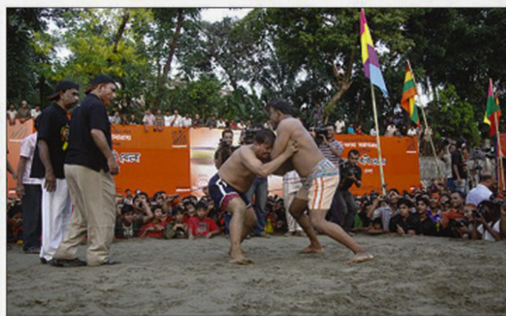
'Jabbar-er Boli Khela' is a wrestling competition and is one of the oldest traditions of the port city.