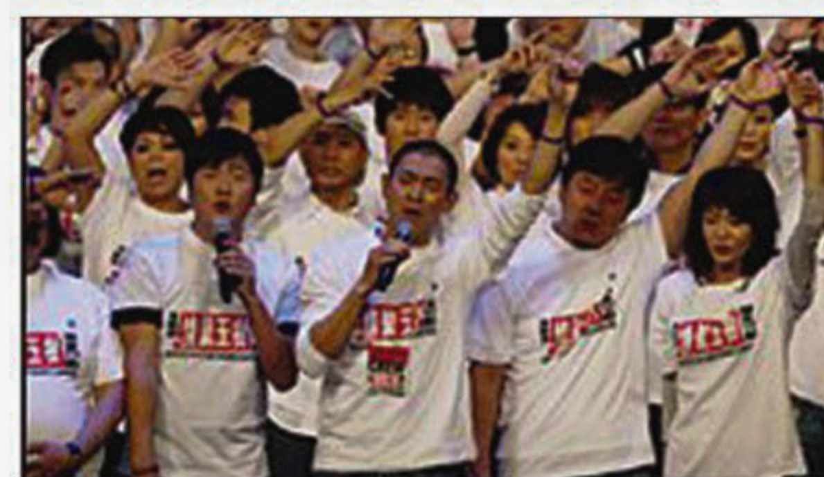
Jackie Chan and other artists.