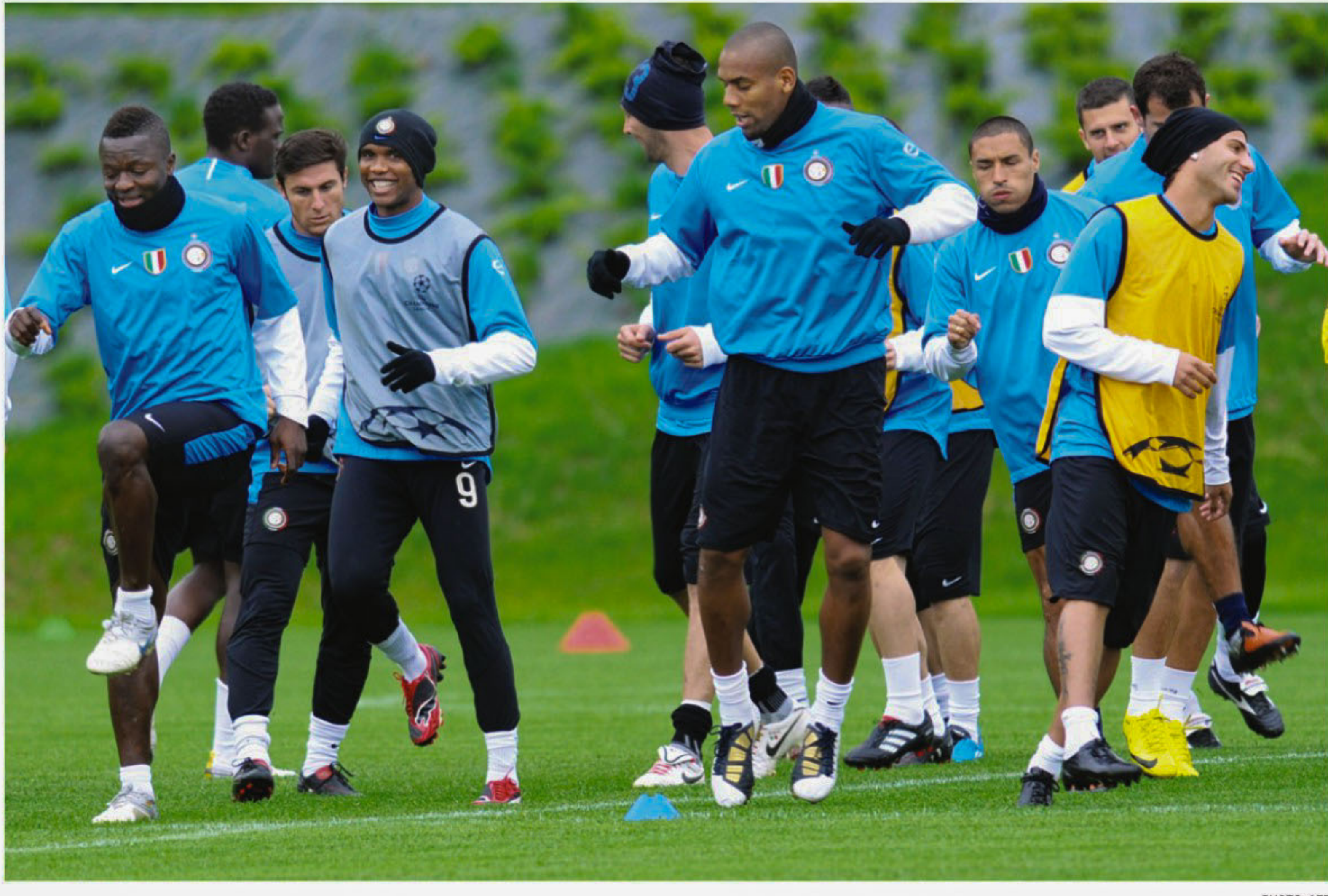
Inter Milan players warm up during a training session at La Pinetin in Appiano Gentile on Tuesday on the eve of their Champions League clash against Barcelona.