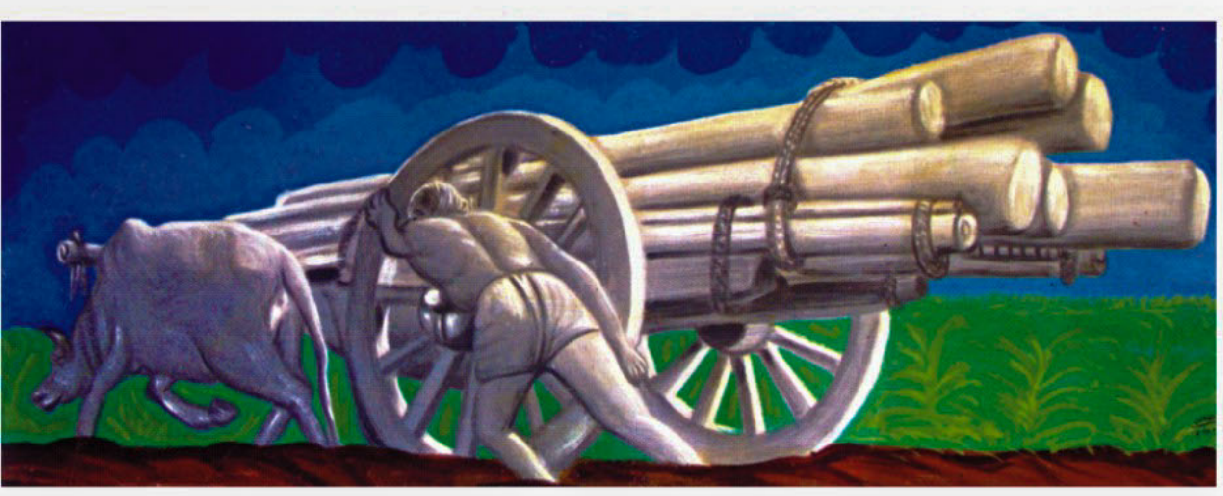
Artworks on display.