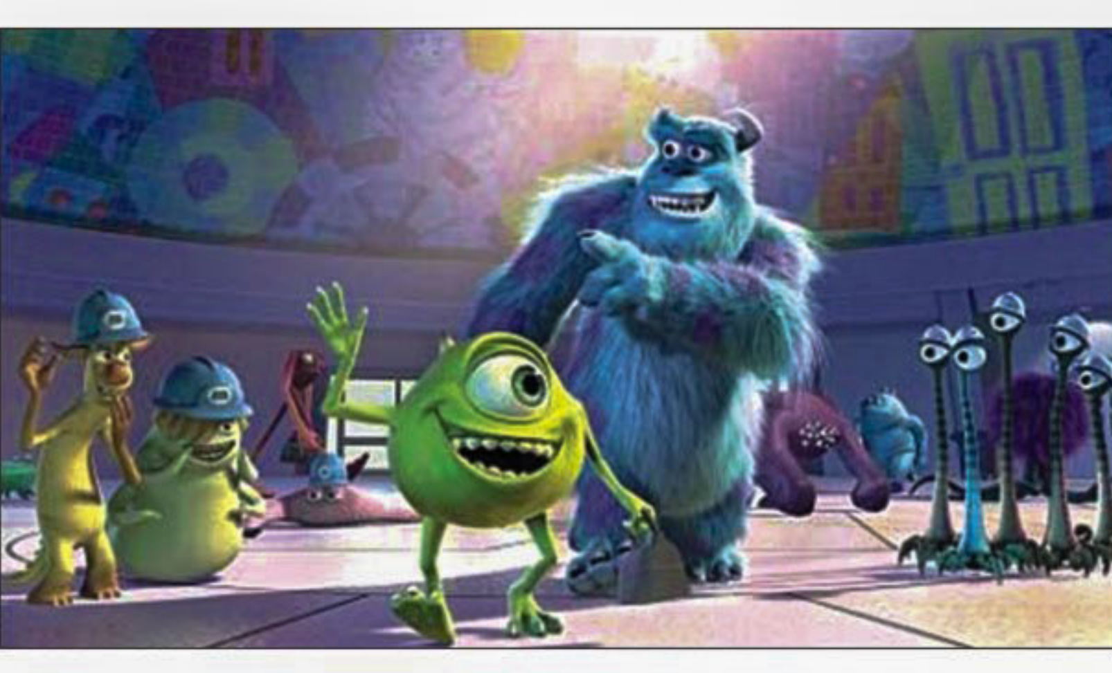
Billy Crystal and John Goodman voiced the lead roles in the original Monsters Inc.