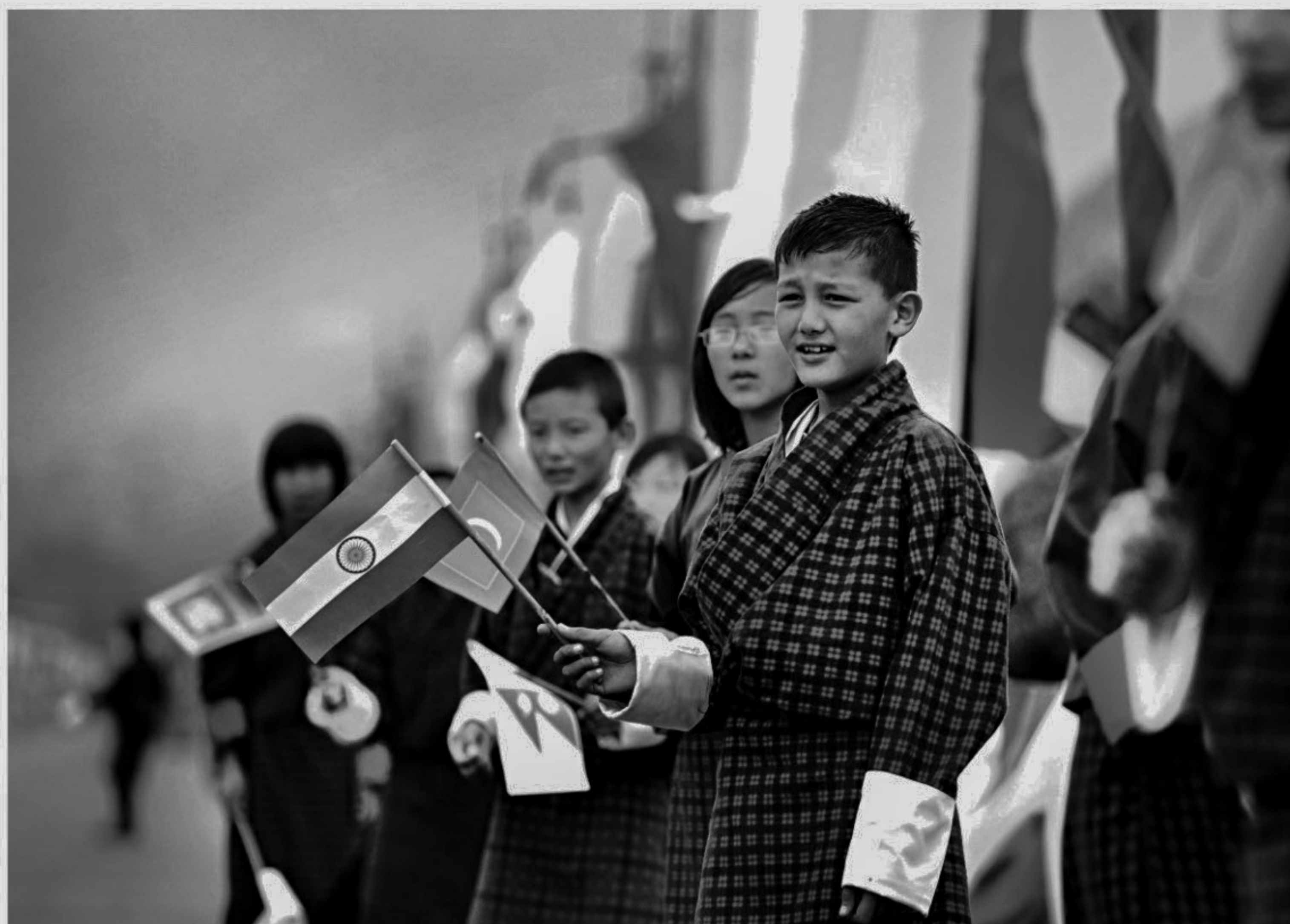
Bhutanese school children await dignitaries arriving for the 16th South Asian Association for Regional Cooperation (Saarc) in Thimphu yesterday. Bhutan is set to host the two-day annual summit of South Asian leaders, which is going to start on April 28.

The home minister added, "Further enquiries are being made into the allegations by the magazine. If any evidence is forthcoming or discovered, the matter will be thoroughly investigated by the appropriate agencies".