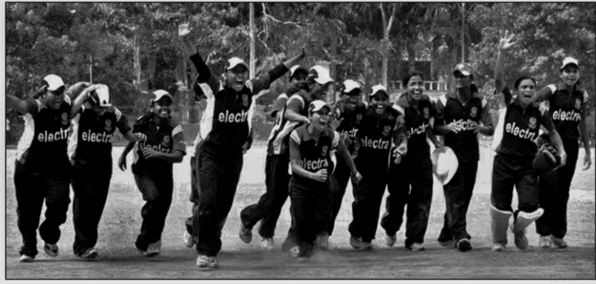
Players of Mohammedan Sporting Club celebrate after they defeated arch-rivals Abahani yesterday at the Gulshan Youth Club ground to reach the final of Women's Club Cup cricket tournament.