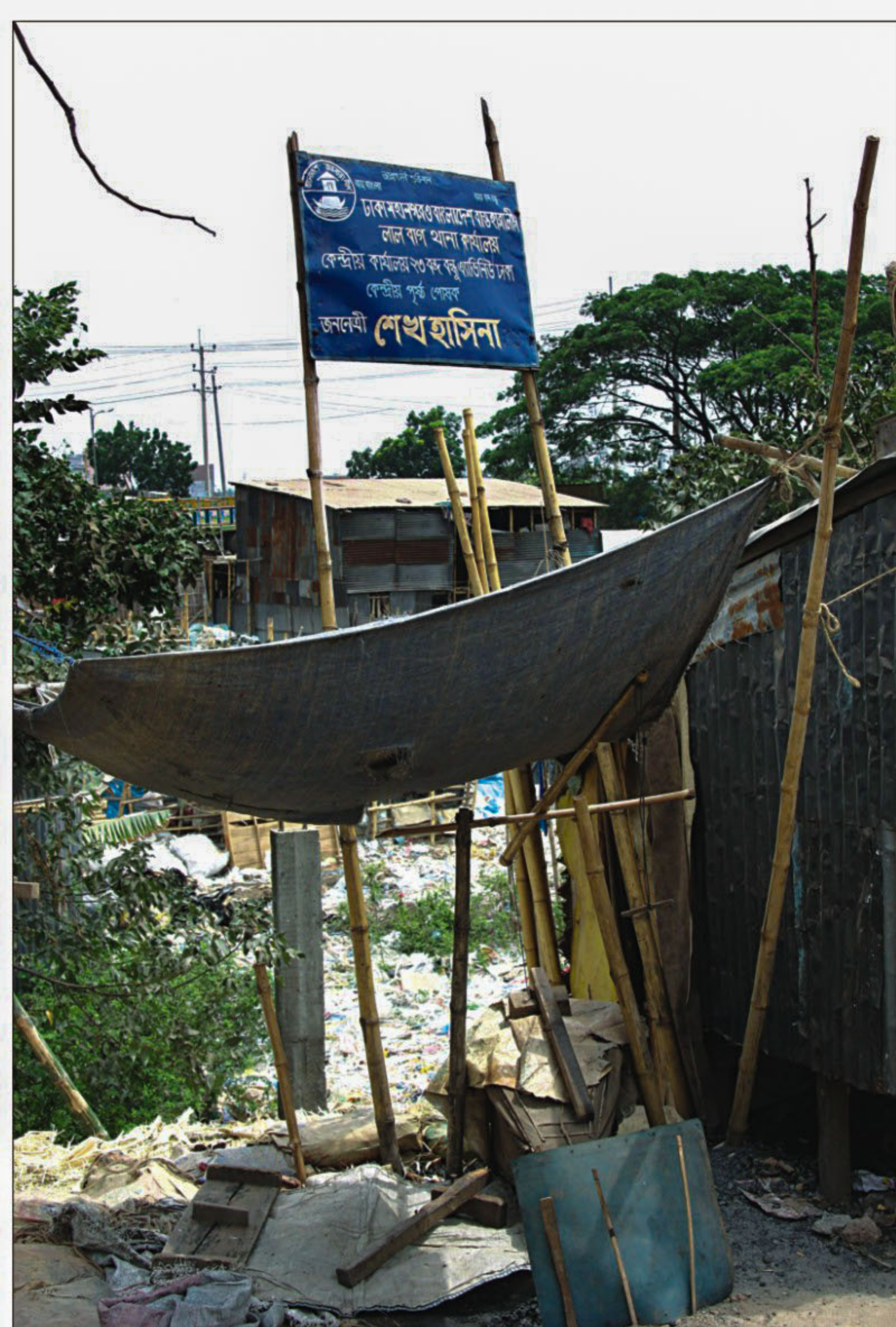
An initiative to grab land beside Dhaka flood protection dam in Lalbagh in the name of Bangladesh Bastuhara League's office. Prime Minister Sheikh Hasina's name is used on the signboard to keep from any trouble and interference of law enforcement agencies. This land was once used for a small blacksmith workshop, which is still evident in the photo.