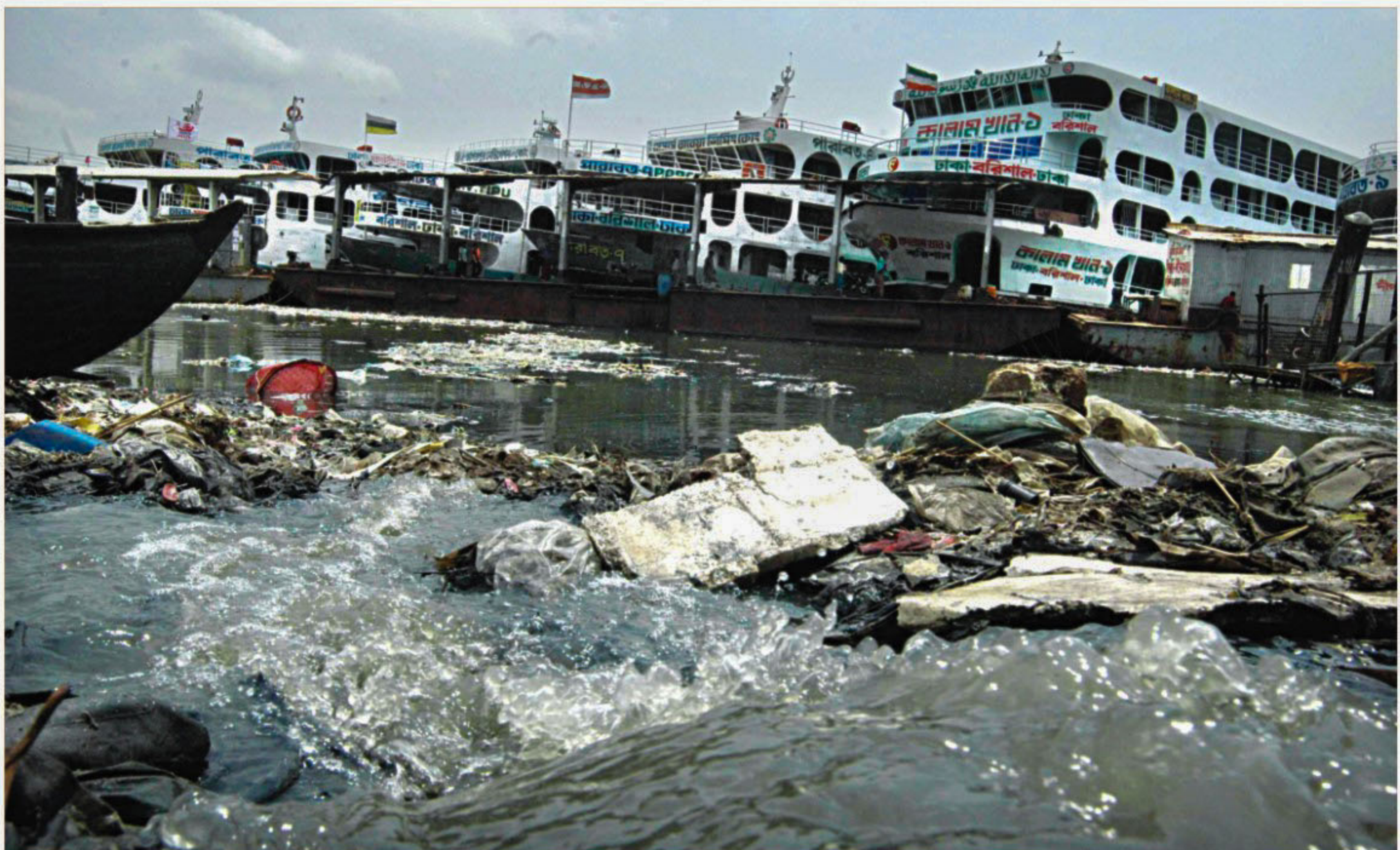
The measure to clean the Buriganga riverbed faces its major flaw, as the government did not make arrangements to divert two-thirds of the city's waste to any treatment plants.