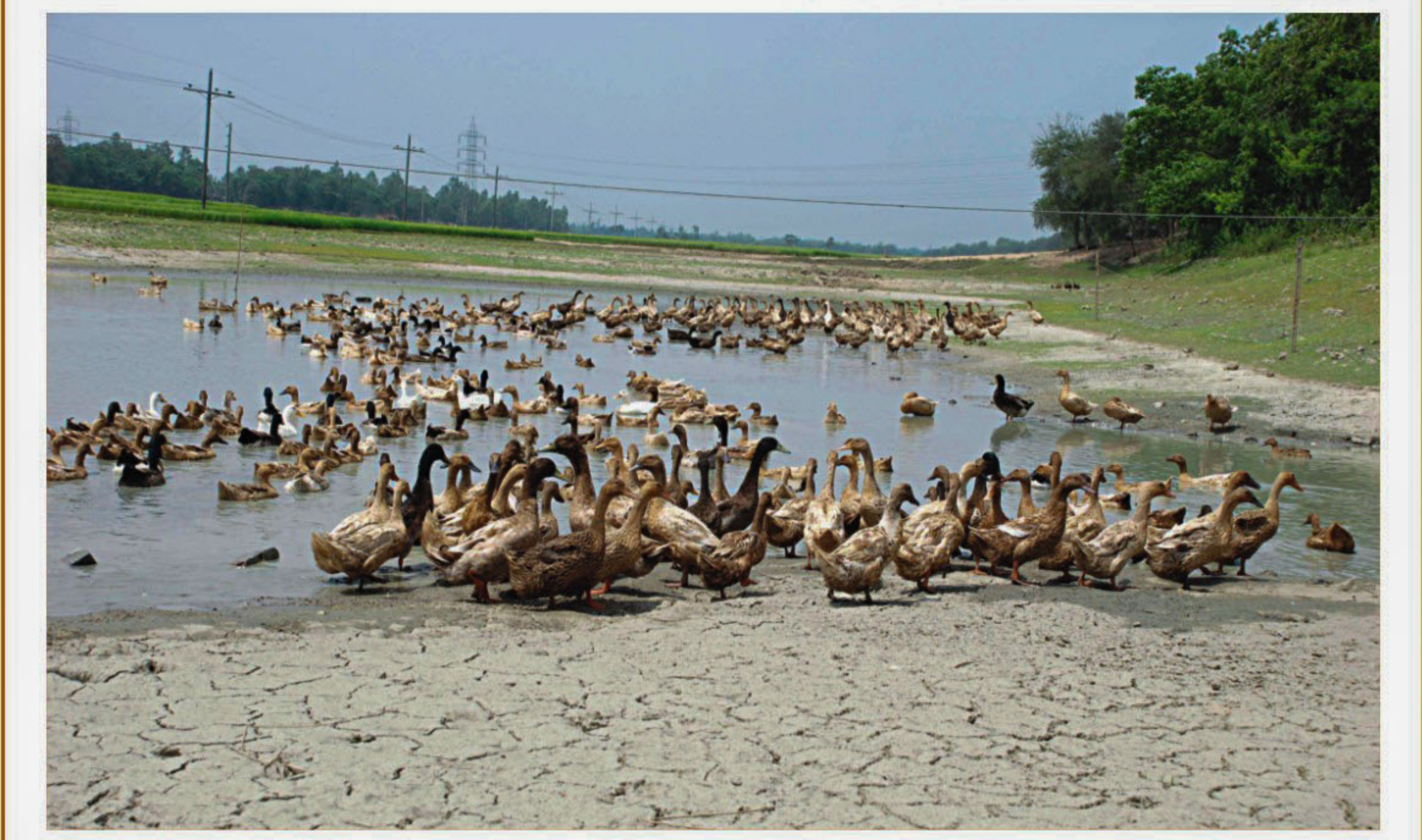
Long dry spell has literally reduced this canal in Chalan Bil area into a burrow, putting the ducks' instinct in jeopardy. Heat and humidity had driven these birds towards water. What they find there makes them frustrated just like people living by the water body.