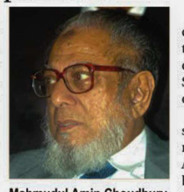
Mahmudul Amin Choudhury

Former chief justice Mahmudul calls for right steps to protect it STAFF CORRESPONDENT Former chief justice Mahmudul Amin Choudhury yesterday compared the judiciary with a "glasshouse" and said it could crumble at any moment if steps are not taken right now. Referring to the remark made by the chairman of a parliamentary body on the chief justice's not swearing in two High Court judges, he said, "It is a threat to the judiciary." He said: "The chairman at a press briefing said the chief justice disrespected the constitution and violated his own oath by not swearing in the two judges, and that is why necessary measures could be taken. "It means he threatened the chief justice that if he administers the oath, he is safe and if he does not, they will send it to the Supreme Judicial Council or take other actions," he went on to say. Chief of the parliamentary standing committee on law ministry Suranjit Sengupta on April 21 said the chief justice will breach his constitutional oath if he does not swear in the two judges. Suranjit at a press briefing at the Jatiya Sangsad media centre also said the constitution of the country does not authorise the chief justice to evaluate judges appointed. The