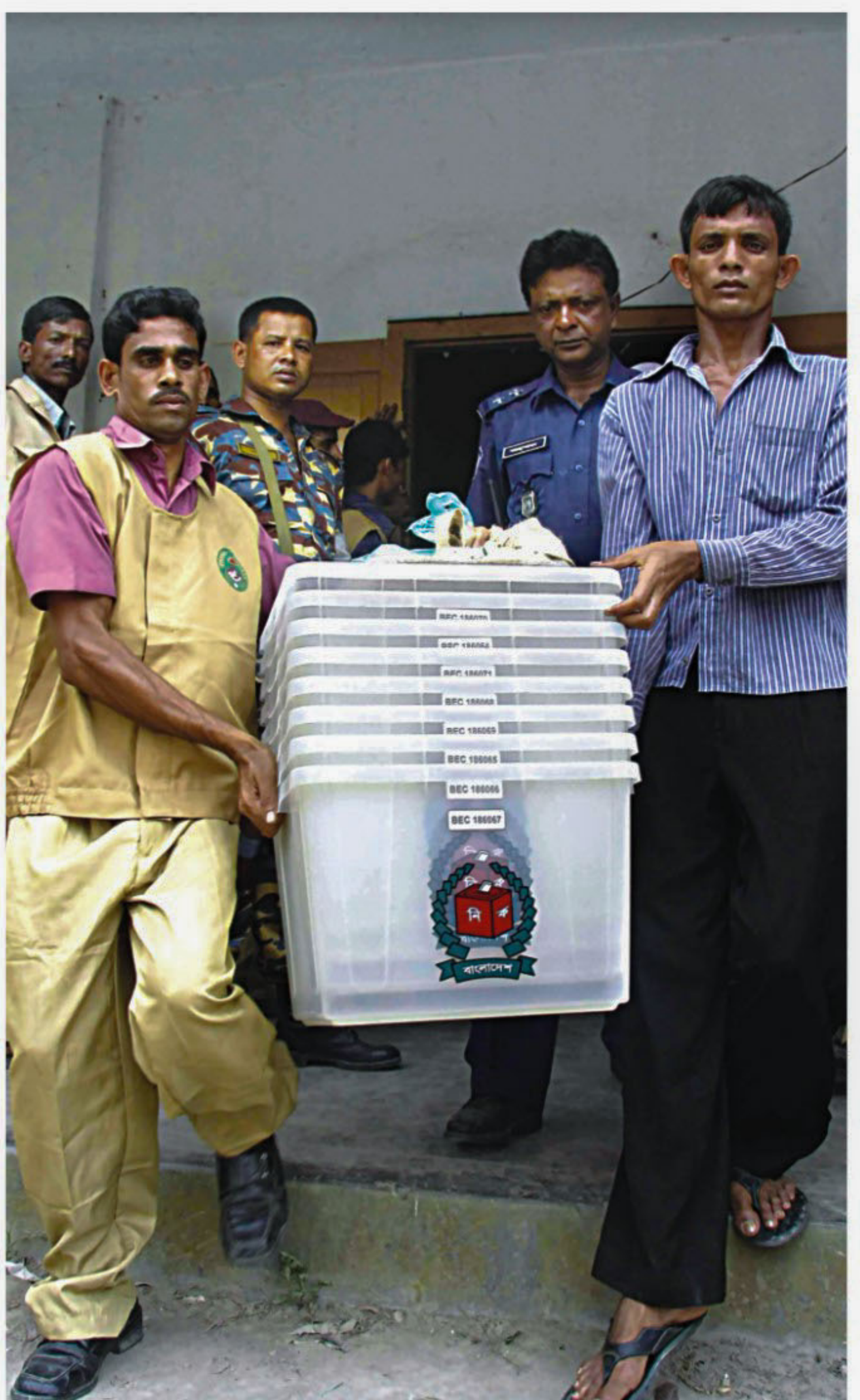
Transparent ballot boxes are being taken to the polling centres of Bhola-3 constituency under strict protection ahead of today's by-polls there.