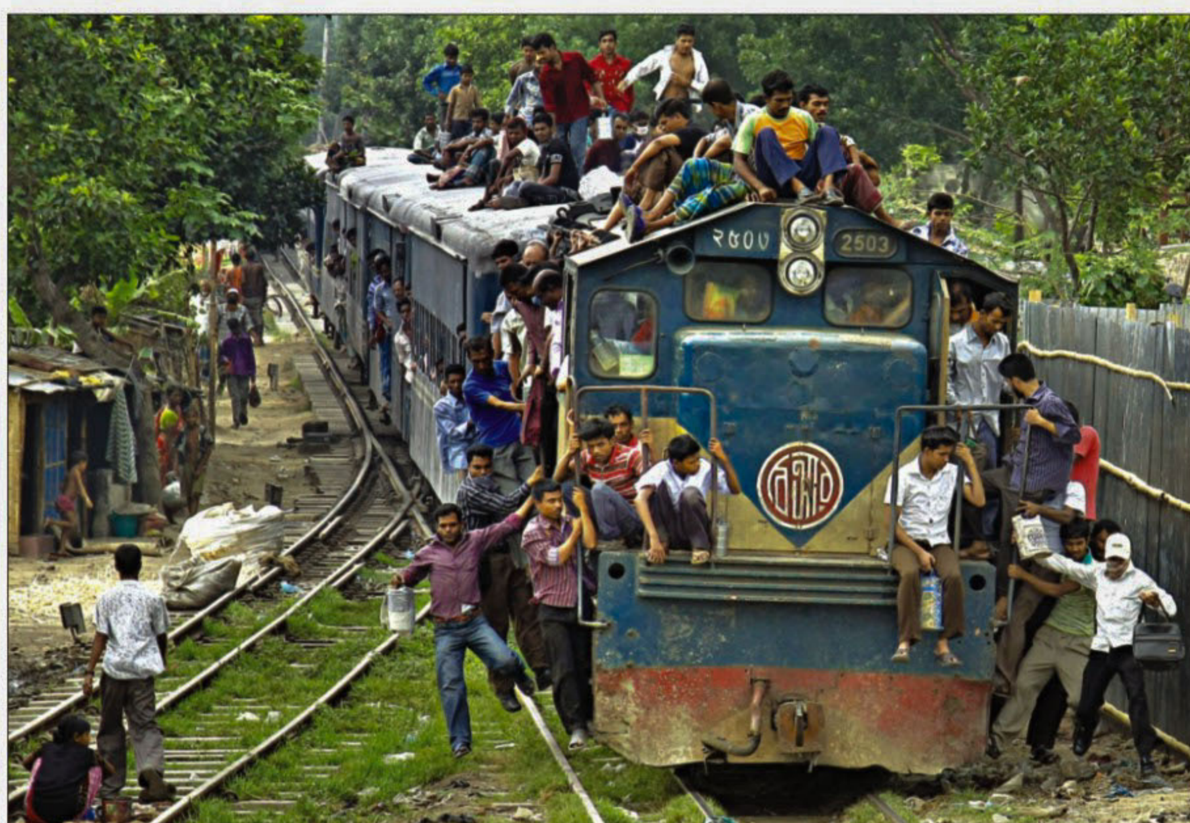
A train coming from Narayanganj enters Kamalapur Railway Station in the city.