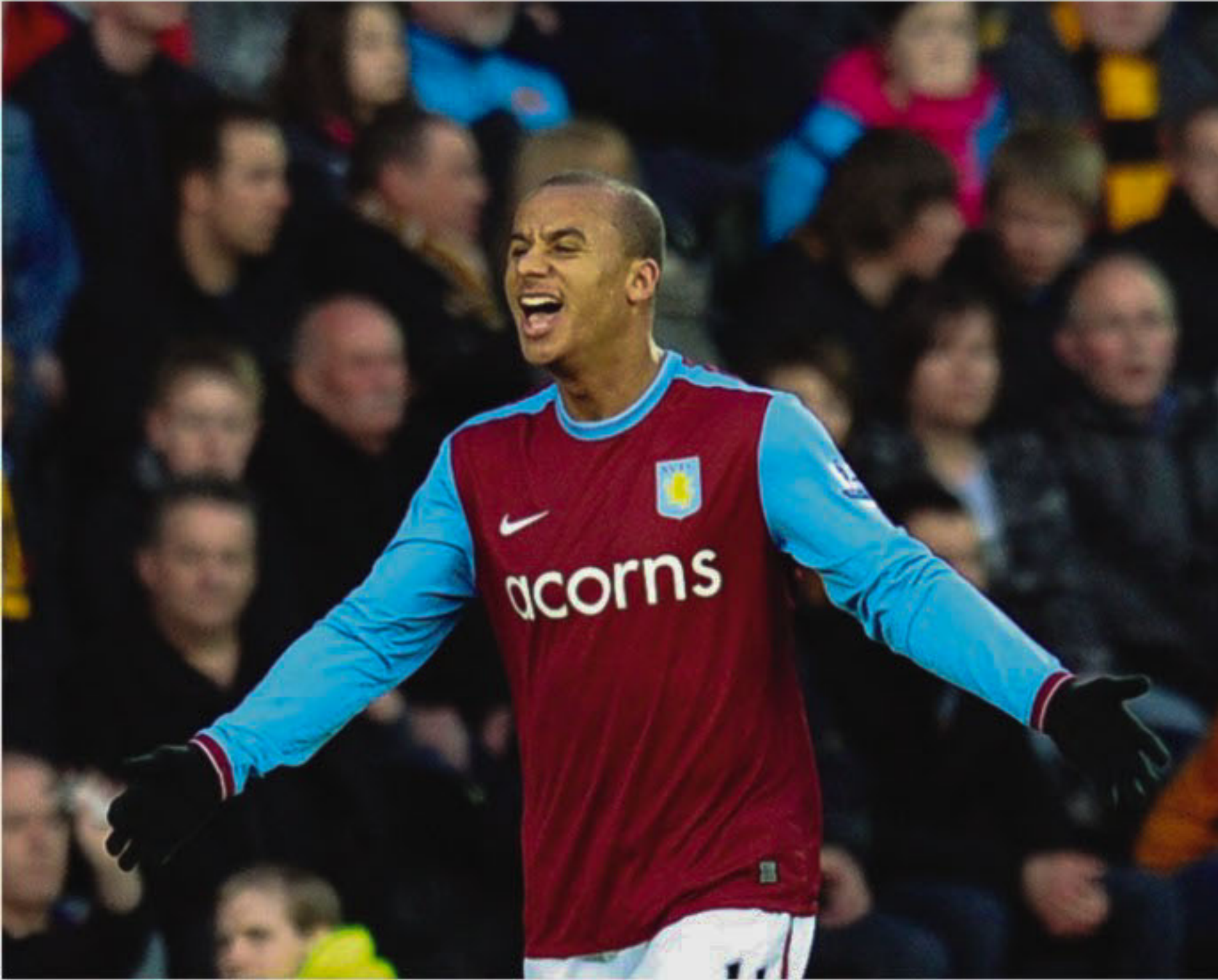
Aston Villa striker Gabriel Agbonlahor is ecstatic after scoring the opening goal against Hull City during their Premier League encounter at the KC Stadium on Wednesday.

And Villa punished Hull's wastefulness when Milner, after being fouled by George Boateng, scored from the penalty spot in the 76th minute.