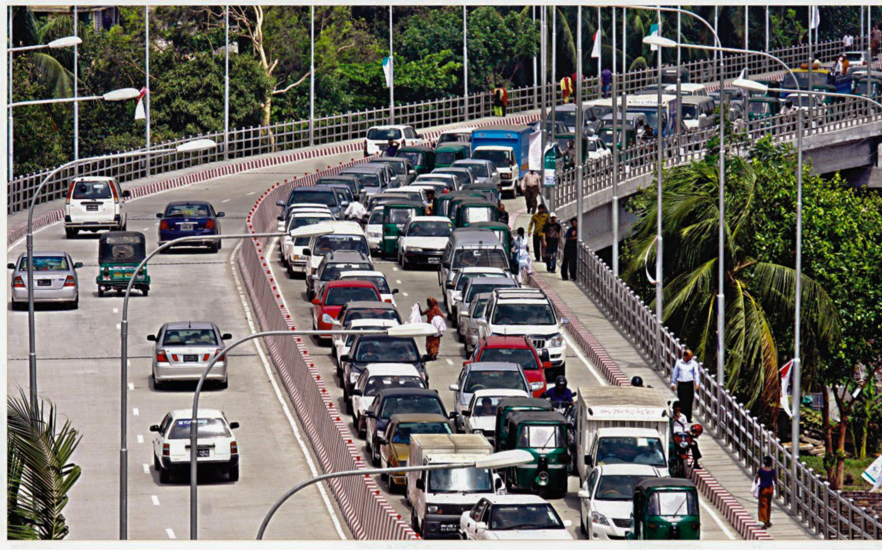
Vehicles are caught in a tailback yesterday on the flyover part of the Bijoy Sarani-Tejgaon Link Road, which was expected to ease the city's traffic congestion.