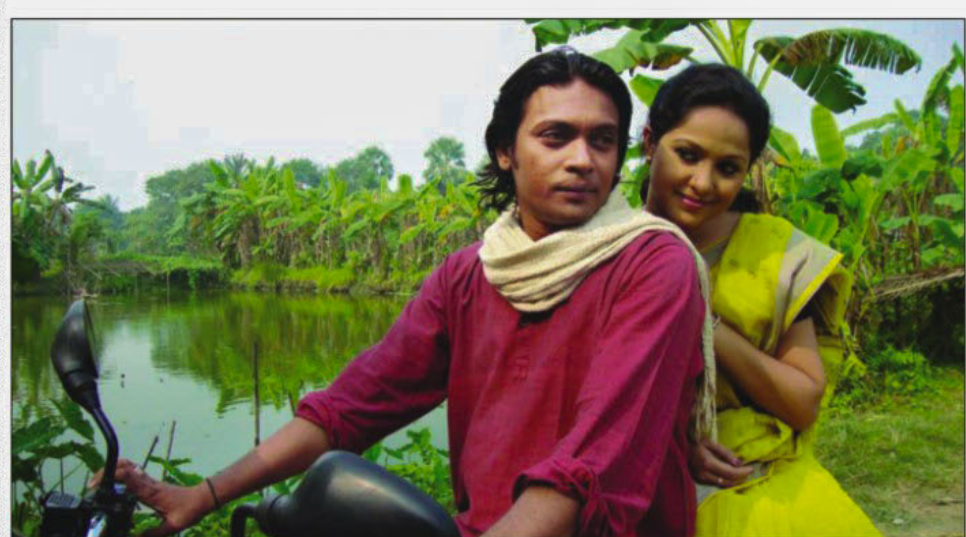
A scene from the serial.