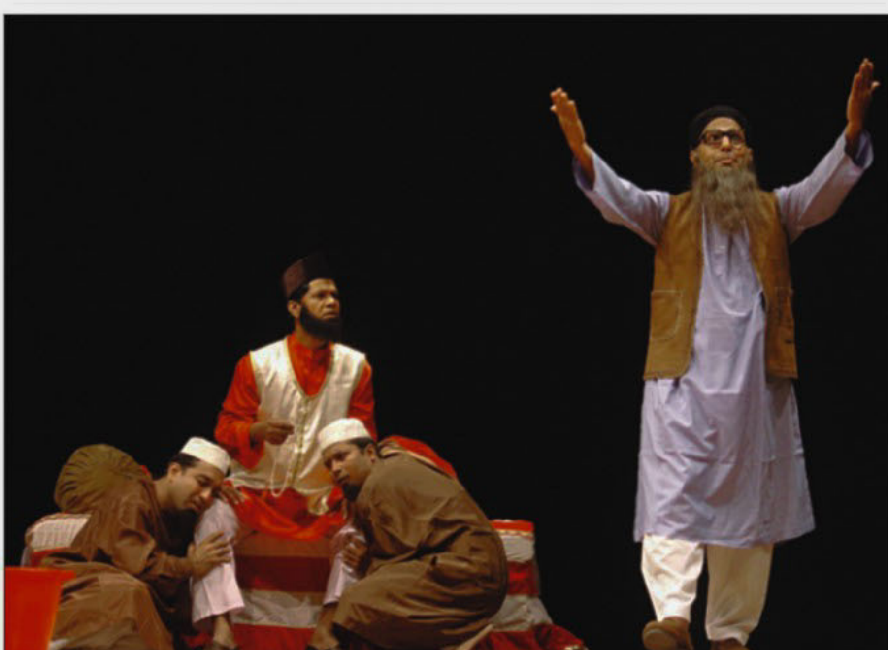
Scenes from "Meraj Fakirer Maa" (left) and "Gazi Kalu Champabati".

acclaimed plays are "The Spy", "The Half Truth" and "Exhibition Opera". Three of his poetry books are being translated into Bangla.