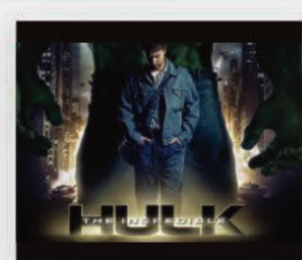
The Incredible Hulk On HBO at 9:30 pm