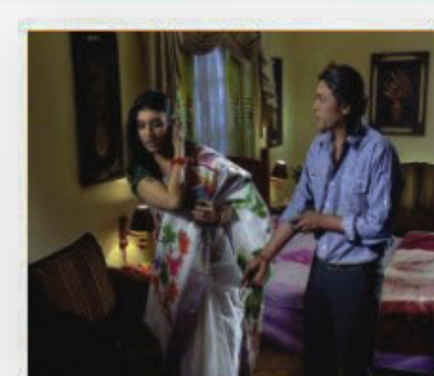
Anubhumi On Desh TV at 8:15 pm