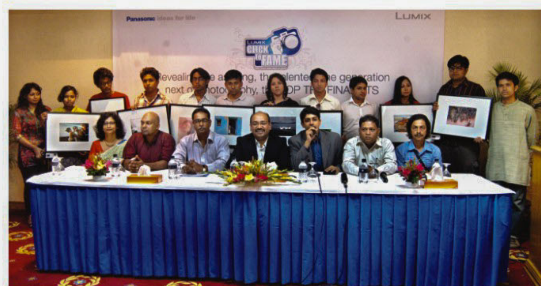
The ten finalists with the judges (front row).

Advertising agency MACOMM has conceptualised the event.