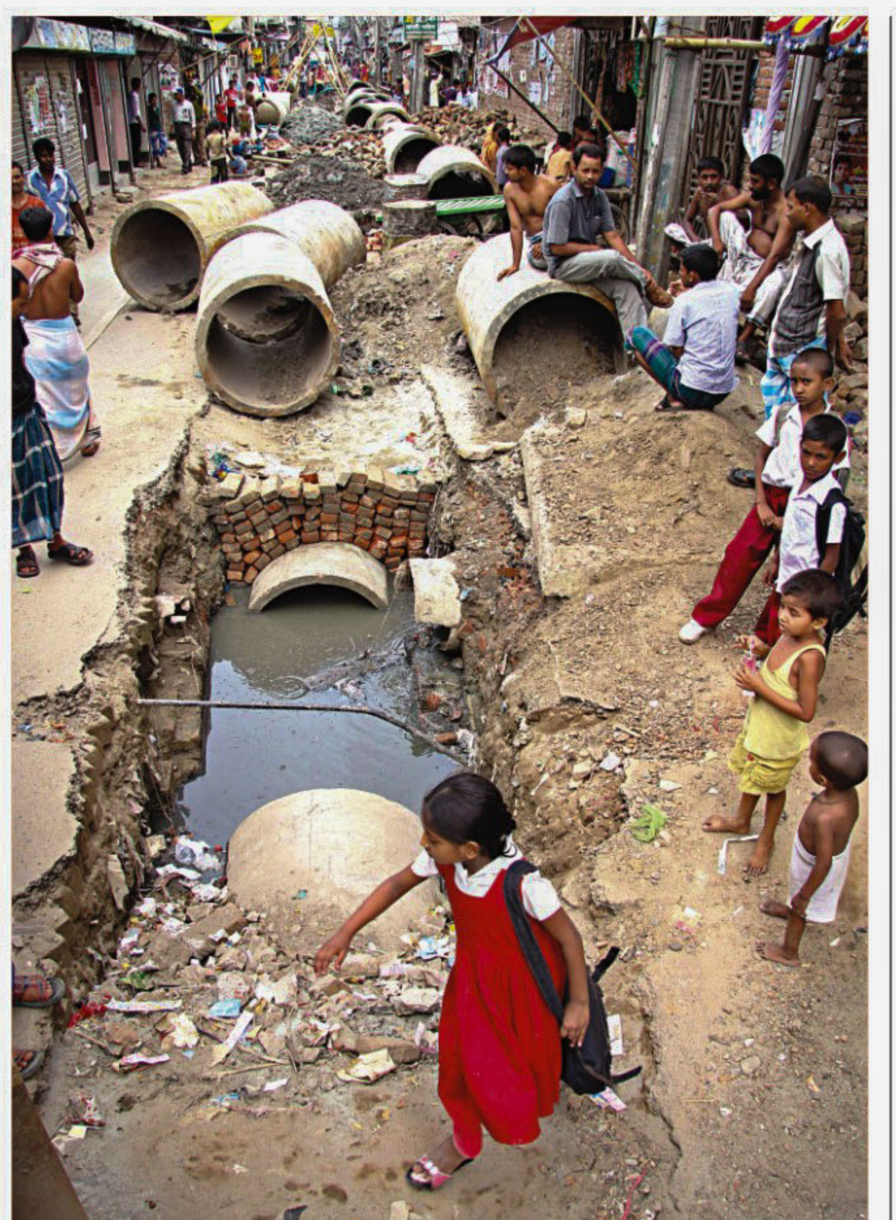
Dug up JN Saha Road in the capital's Lalbagh area for laying sewer pipes. Locals fear the sewer will be dysfunctional soon after the work completes, as they allege the contractor has been using low quality materials. The photo was taken yesterday.

DIPLOMATIC CORRESPONDENT US Deputy Secretary of State James B Steinberg yesterday said some questions like the trial of war criminals have to be resolved through the internal political process of Bangladesh. "It is important to have accountability and fairness in any proceeding or process, but how it would be carried out in a specific circumstance is to be decided by the people of the country," he said while addressing a media briefing in Sonargaon Hotel. Steinberg, who is a deputy of US Secretary of State Hillary Clinton, arrived early yesterday on a brief visit to Bangladesh and is due to depart Dhaka early this morning. During his daylong hectic programmes, he had discussions with Prime Minister Sheikh Hasina, Leader of the Opposition Khaleda Zia, Foreign Minister Dipu Moni, Commerce Minister Faruq Khan, and members of the civil society. Speaking about the democratic process in Bangladesh, Steinberg said the last general election was a positive step towards strengthening democracy. Encouraging cooperation between the government and the opposition for finding a common ground for welfare of the people, he said it is important that all political parties work together, and create an atmosphere for open and tolerant debates. SEE PAGE 15 COL 4 SEE MORE STORY ON PAGE 2