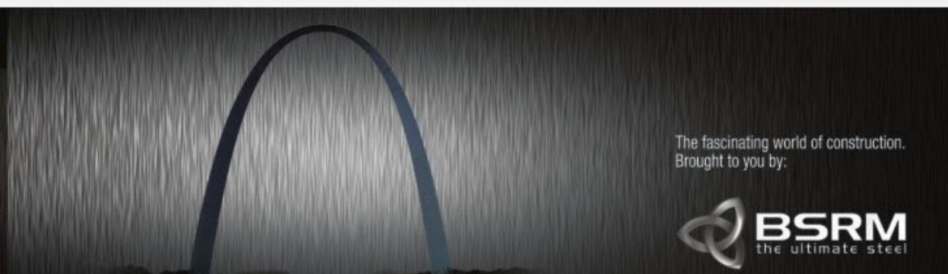
The fascinating world of construction. Brought to you by:

The Gateway Arch is an integral part of the Jefferson National Expansion Memorial and the iconic image of St. Louis, Missouri. It stands 630 feet (192 m) tall, and is 630 feet (192 m) wide at its base, making it the tallest monument in the United States.