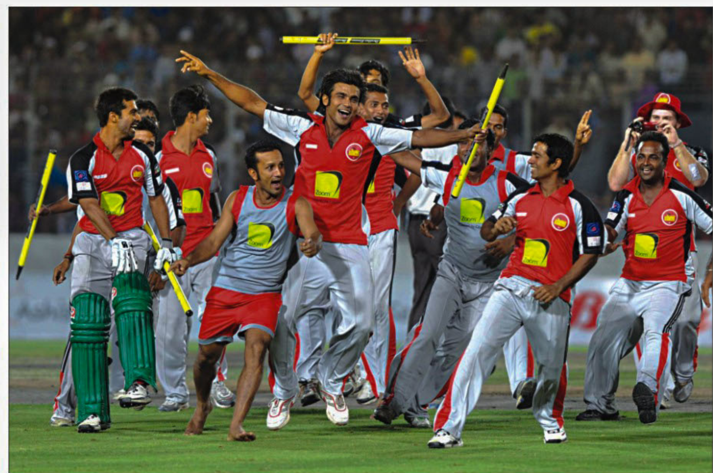
RANGERS REIGN: Rajshahi Rangers players run for joy after beating Kings of Khulna by six wickets in the final of the Destiny Group NCL T20s at the Sher-e-Bangla National Stadium in Mirpur yesterday. (Story on page 17)