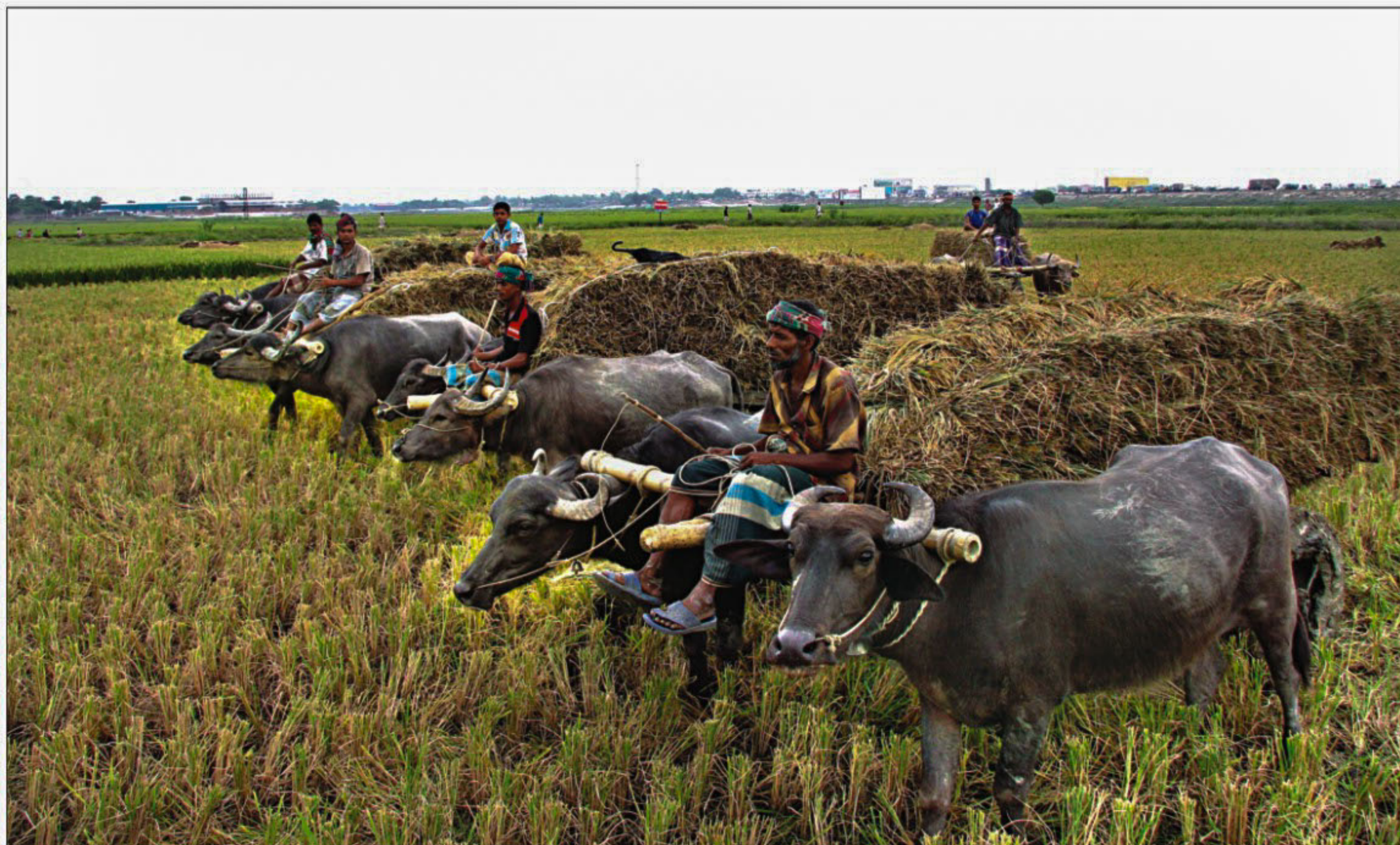
Farmers are busy harvesting Boro paddy with the expectation of fair price for the crops this season. The photo was taken near Ashulia on the outskirts of the capital yesterday.