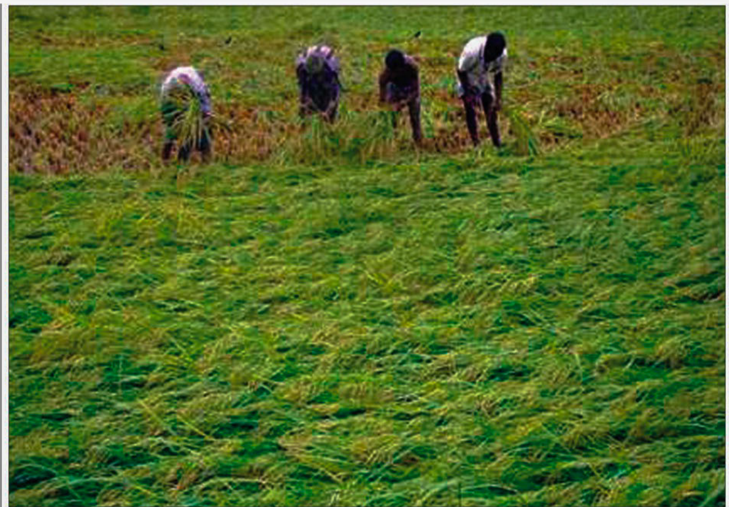
Farmers cutting immature boro paddy at Goderhat village in Gaibandha Sadar upazila as hailstorms during the last three days damaged the standing crops only a few days before its ripening.

Police arrested Moti Miah, 45, Kala Miah, 42, and wife of Kuddus of the area suspecting their involvement with the murder.