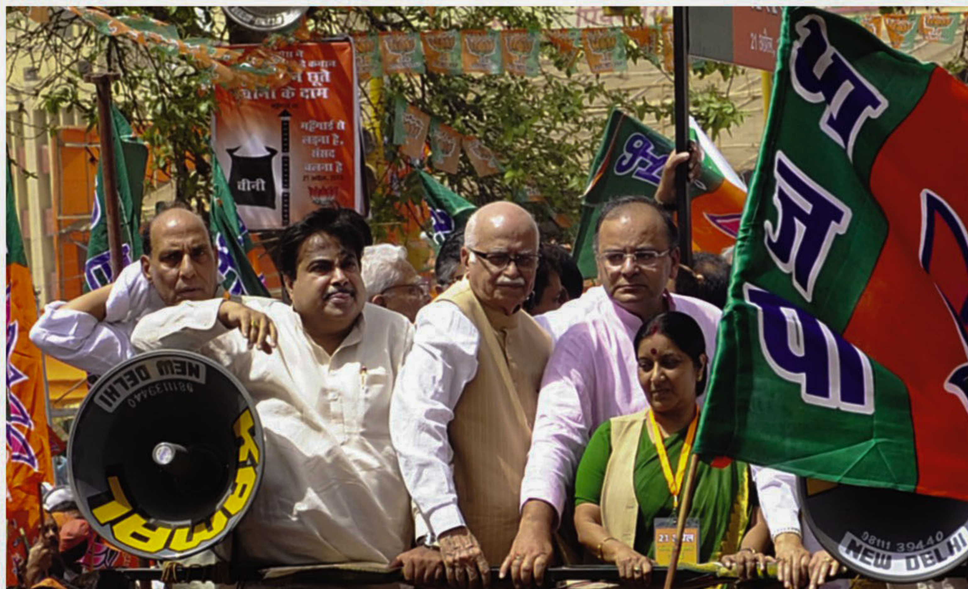
Leader of opposition and senior leaders of Bharatiya Janata Party (BJP) Shushma Swaraj (R), Lal Krishna Advani (C), President Nitin Gadkari (2L) and fellow senior leaders stand on top of a truck as they lead a rally in New Delhi yesterday, held as a part of a nationwide agitation to protest spiralling prices of essential commodities.

A UN commission has blamed Pakistani authorities for their failure to protect Bhutto, saying security arrangements were 'fatally insufficient and ineffective' and subsequent investigations into her death involved a whitewash.