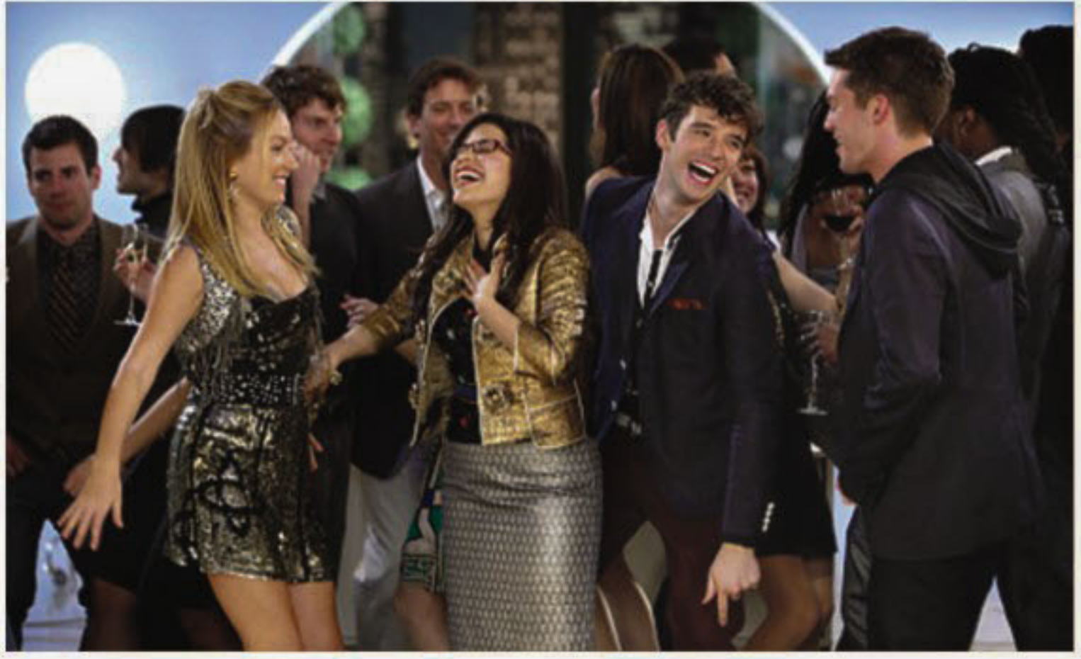
(From left) Becki Newton, America Ferrara and Michael Urie in the concluding episode of "Ugly Betty".

Notwithstanding the odd fruitless detour, they have served us well, these four seasons. The show ended, as it began: a story of renewal, of identity claimed and proclaimed, of lighting out for the territories.