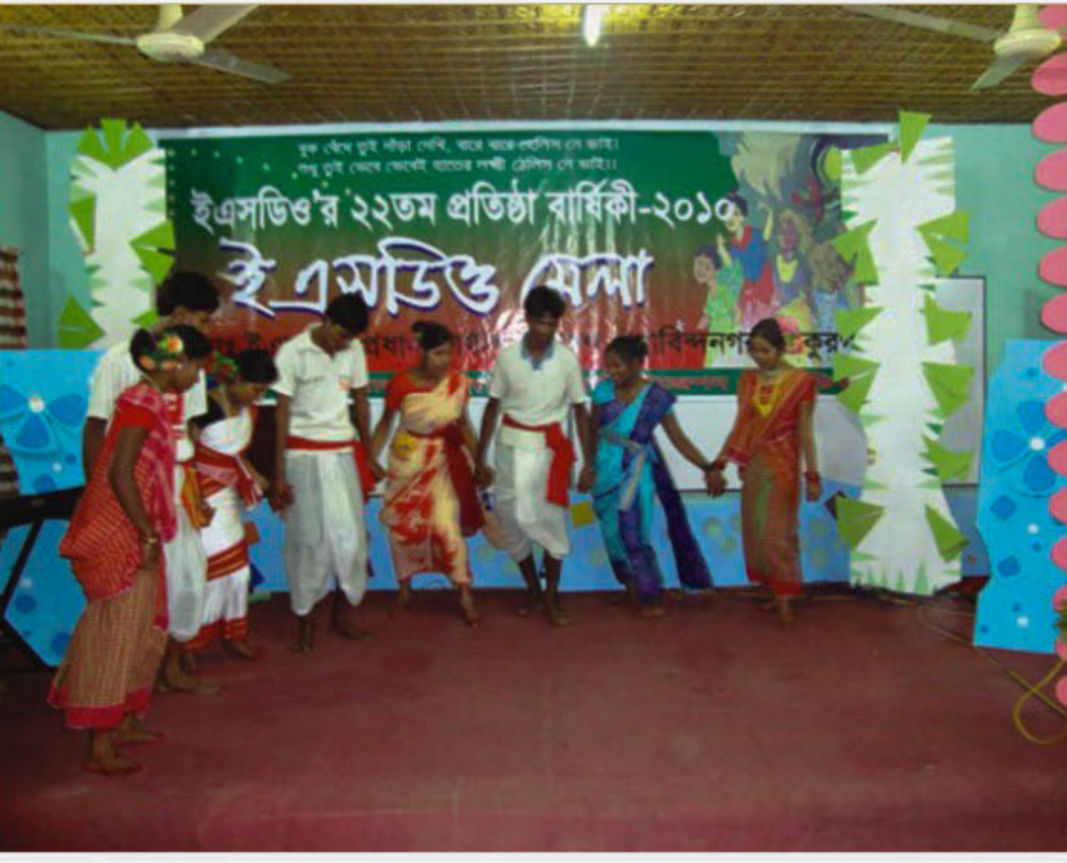
Indigenous artistes dance at the event.