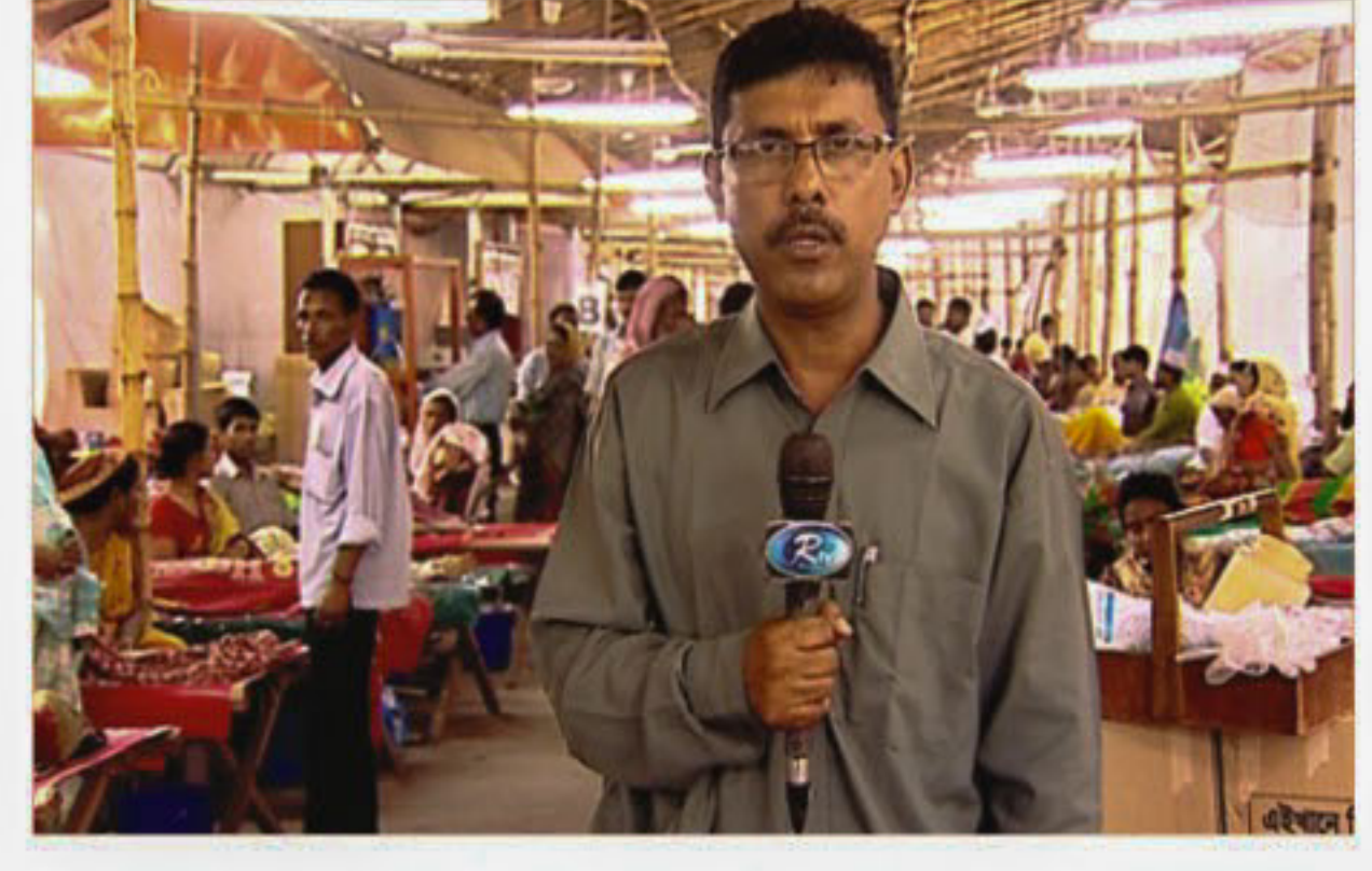
Tonight's episode highlights the outbreak of waterborne diseases in the city.