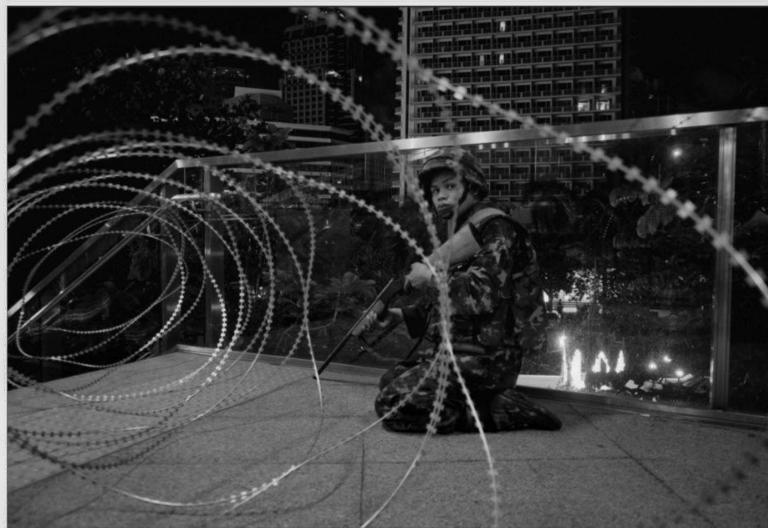
A Thai armed soldier takes up position on a walkway at the entrance to Silom road in the financial district of Bangkok yesterday. Hundreds of Thai troops, many of them armed, were deployed on the streets of Bangkok to protect the city's financial heart from anti-government rallies.