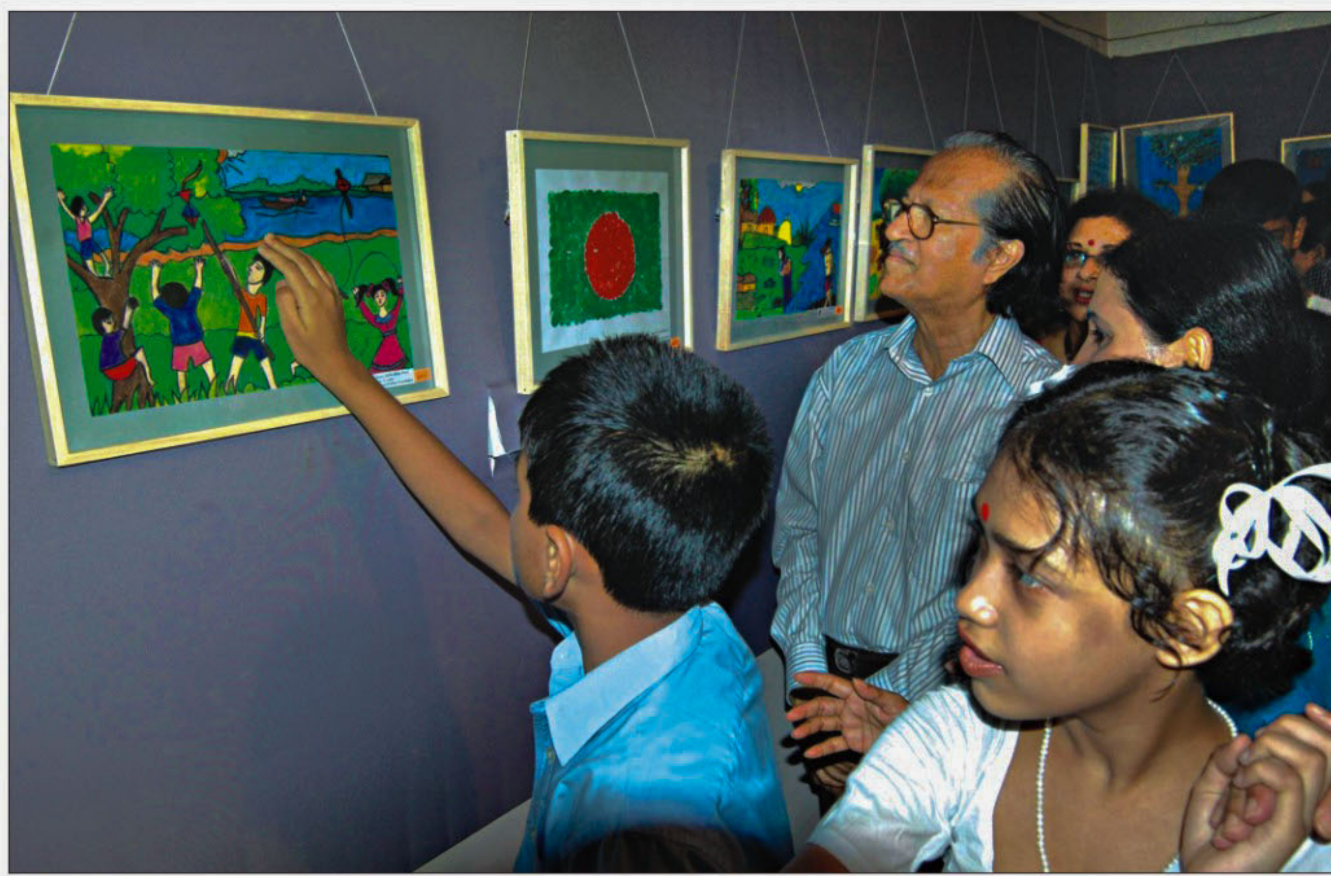
An exhibition of artworks by children with autism held on the Autism Welfare Foundation premises in the city recently on the occasion of the World Autism Awareness Day.

"Autistic children are not mad. Somehow they have some problems in brain development, that is why they behave not like other