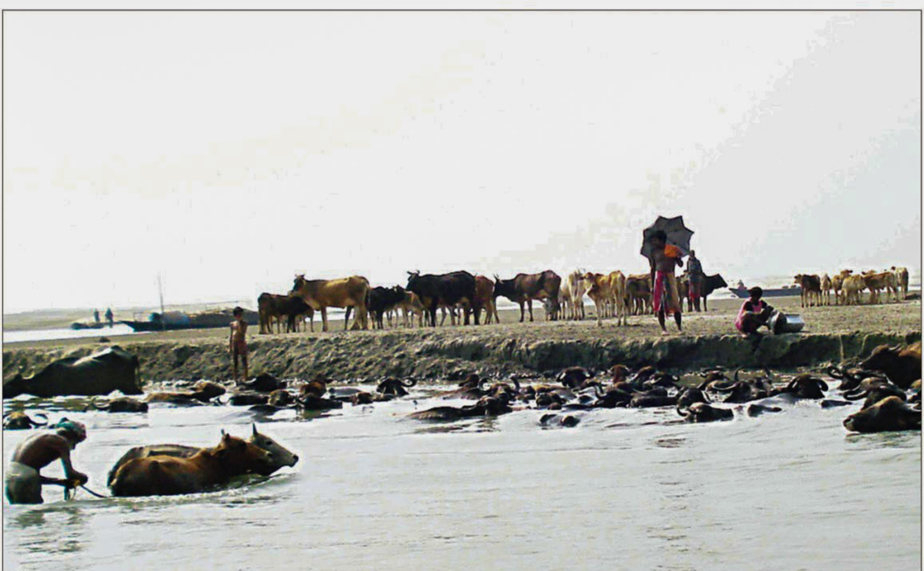
Cattle farming on shoals in the river Jamuna has become a growing business, as grasses are aplenty there nowadays for grazing. Professional cow herders are appointed to take care of the animals. The photo was taken at Gabsara in Bhuapur upazila of Tangail yesterday.