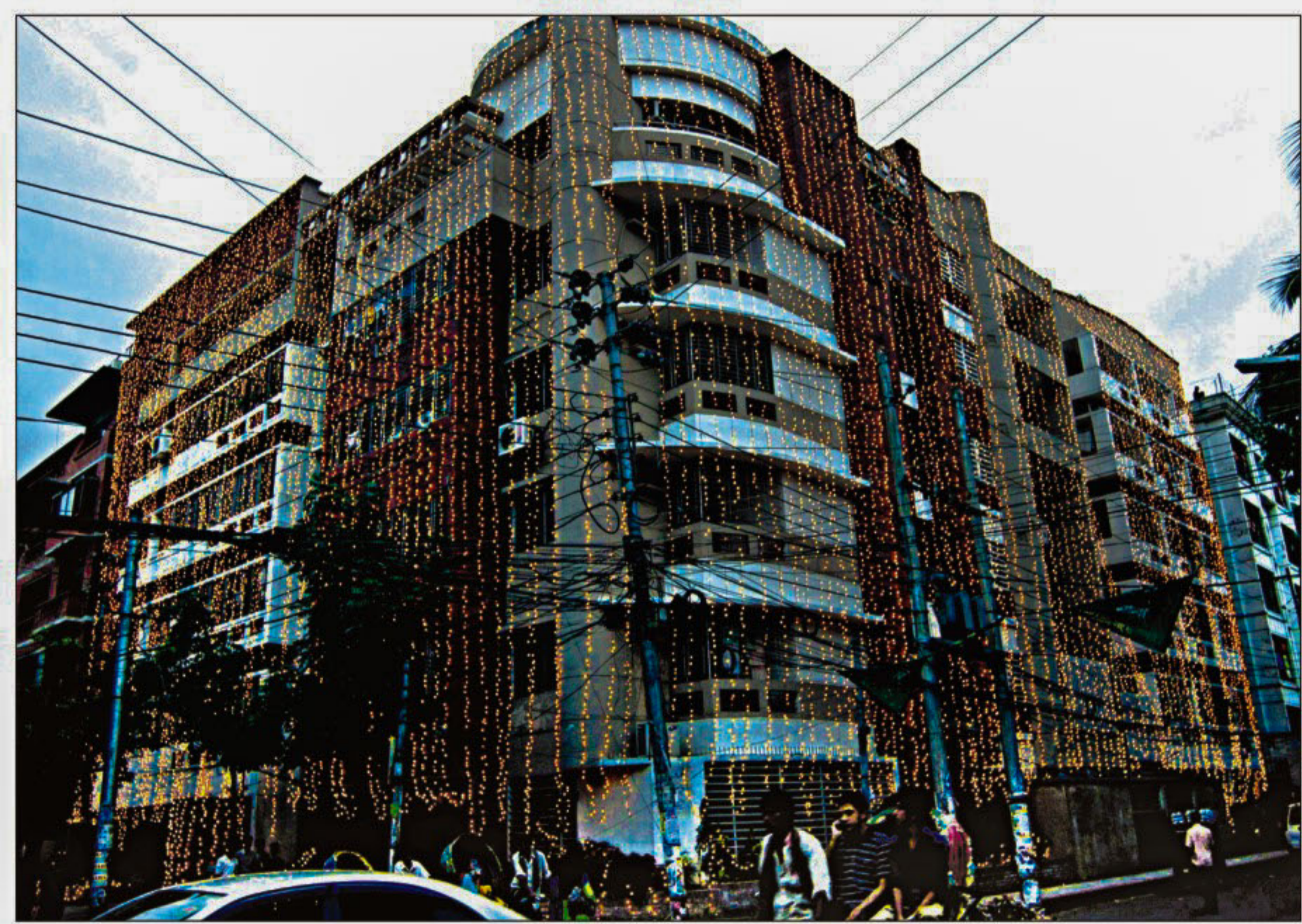
An apartment building on Road 11A in Dhanmondi of the capital is adorned with decorative illumination even during daylight yesterday, while the country reels under frequent load shedding leading to loss of industrial production and untold sufferings of citizens.