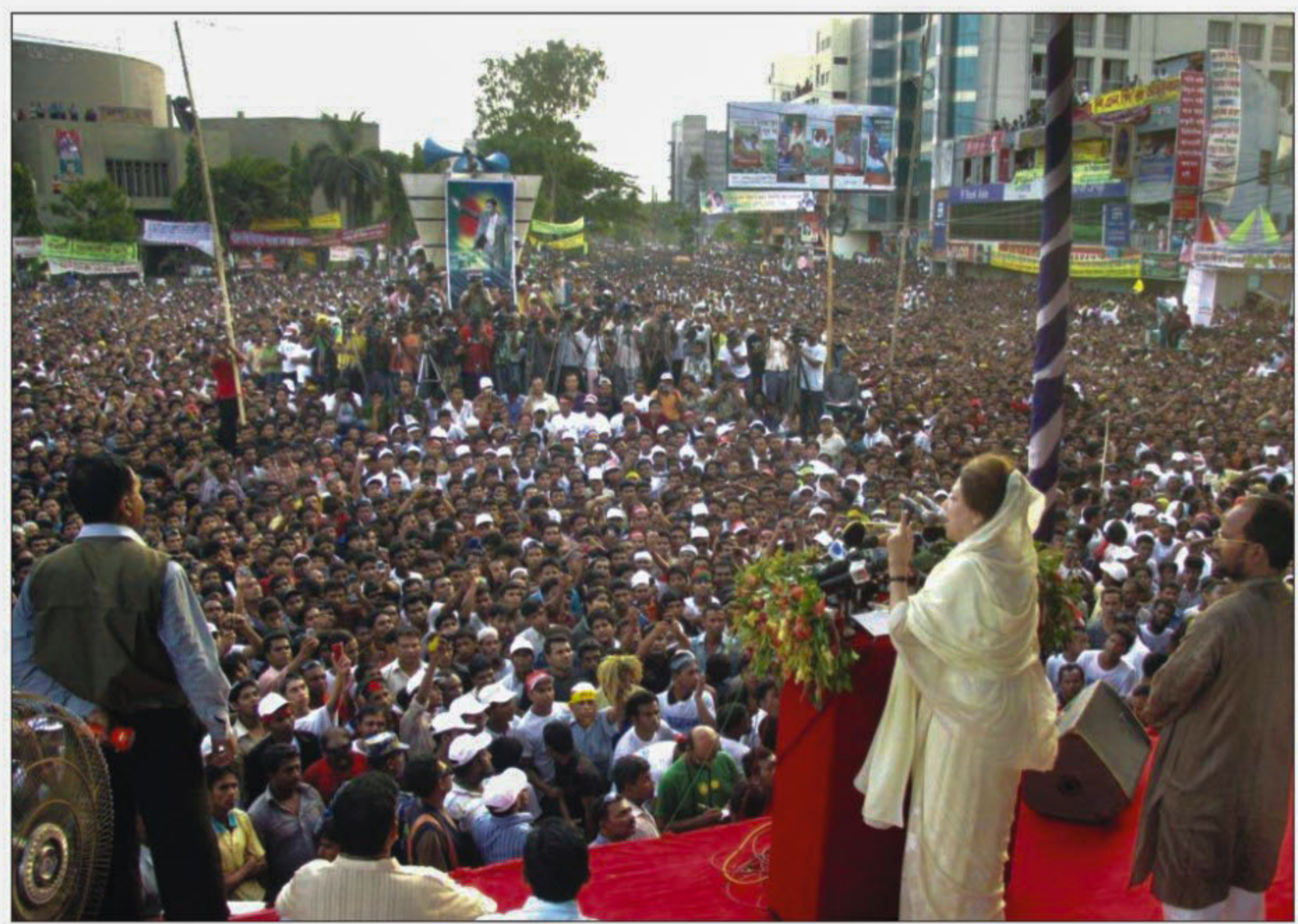
Leader of the Opposition in Parliament and BNP Chairperson Khaleda Zia addresses a huge public meeting at Babri Square in Khulna yesterday. (Story on Page 1)

He called on the stakeholders of South Asian countries to make a firm decision in this connection.