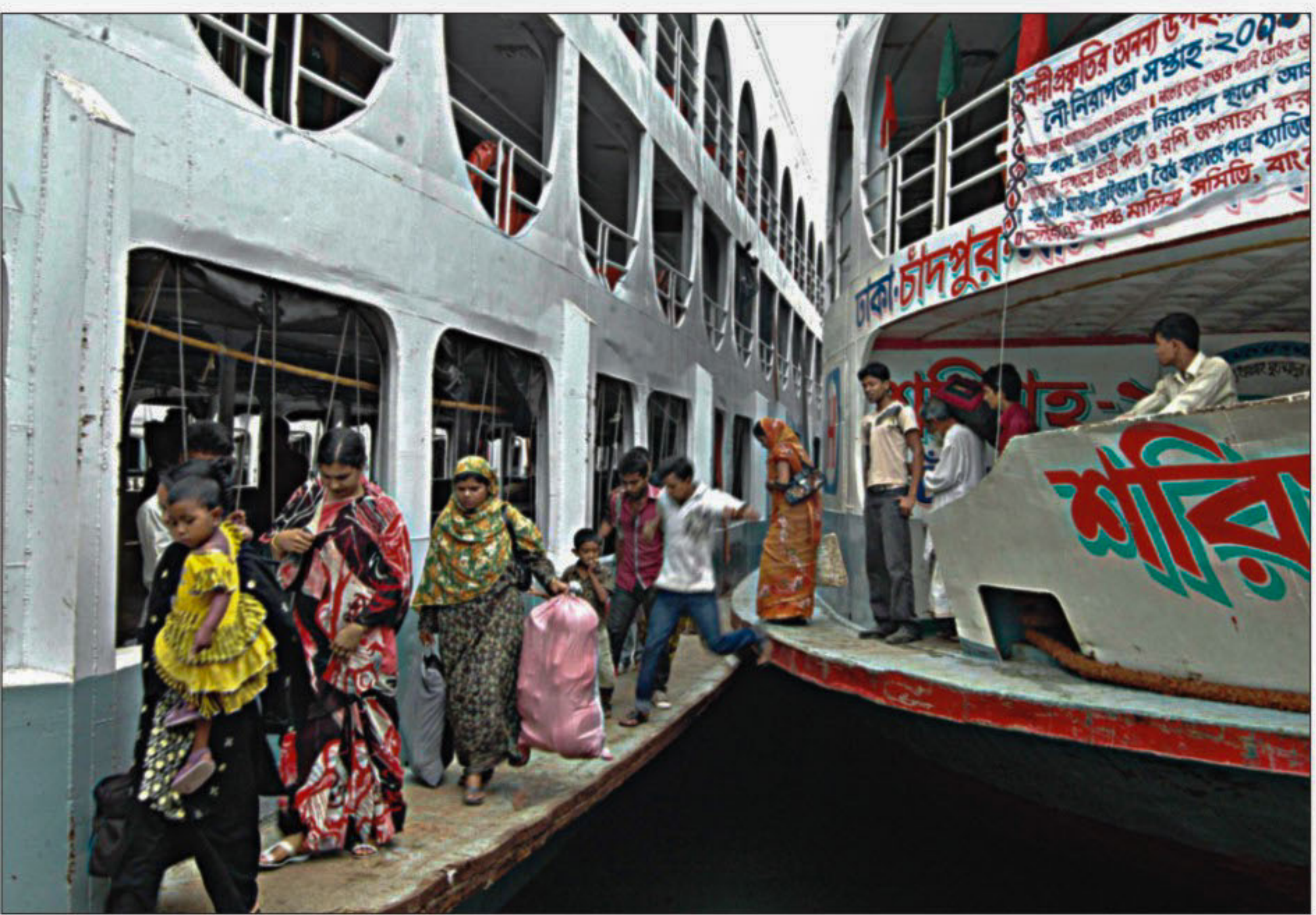
When the Maritime Safety Week 2010 is being observed pompously, women and children as well as elderly people along with their belongings land on the Sadarghat launch terminal in the city risking their lives. The photo was taken yesterday.