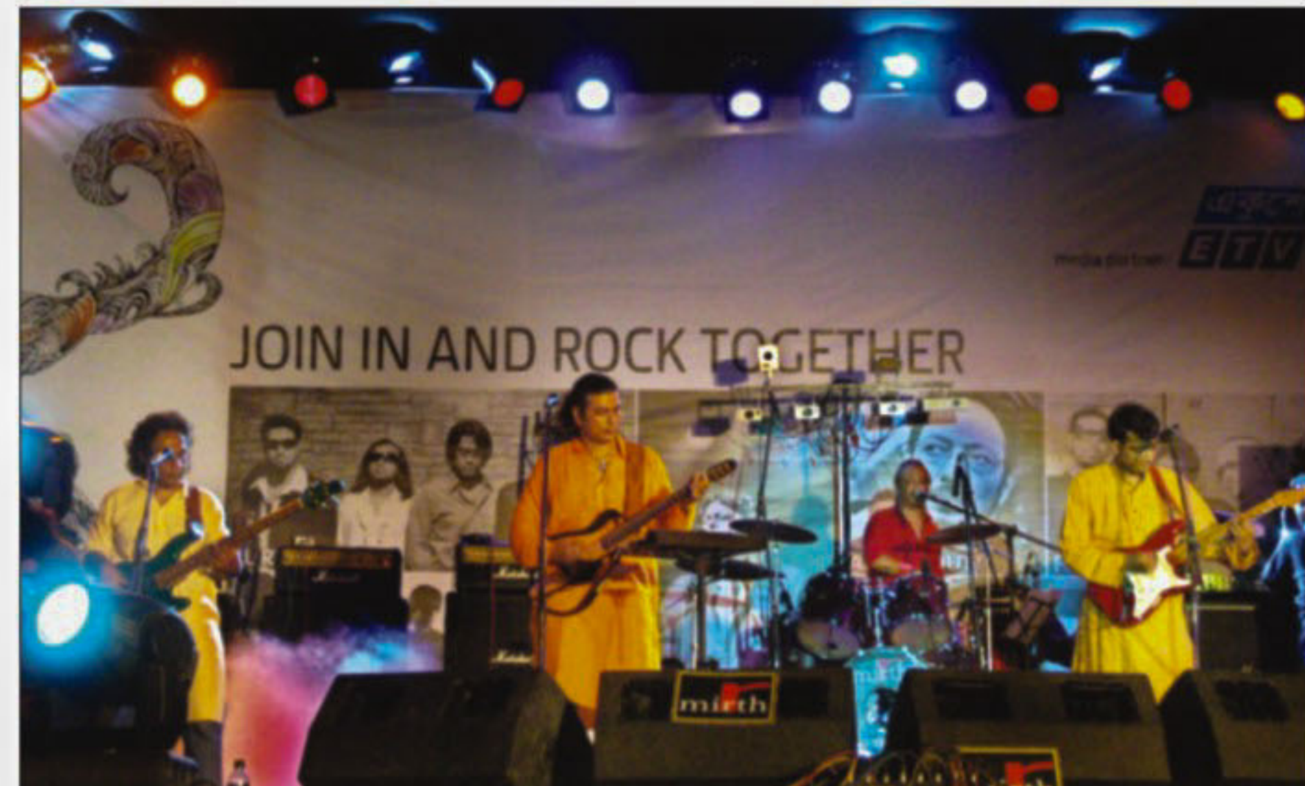
Kolkata bonus for the audience.