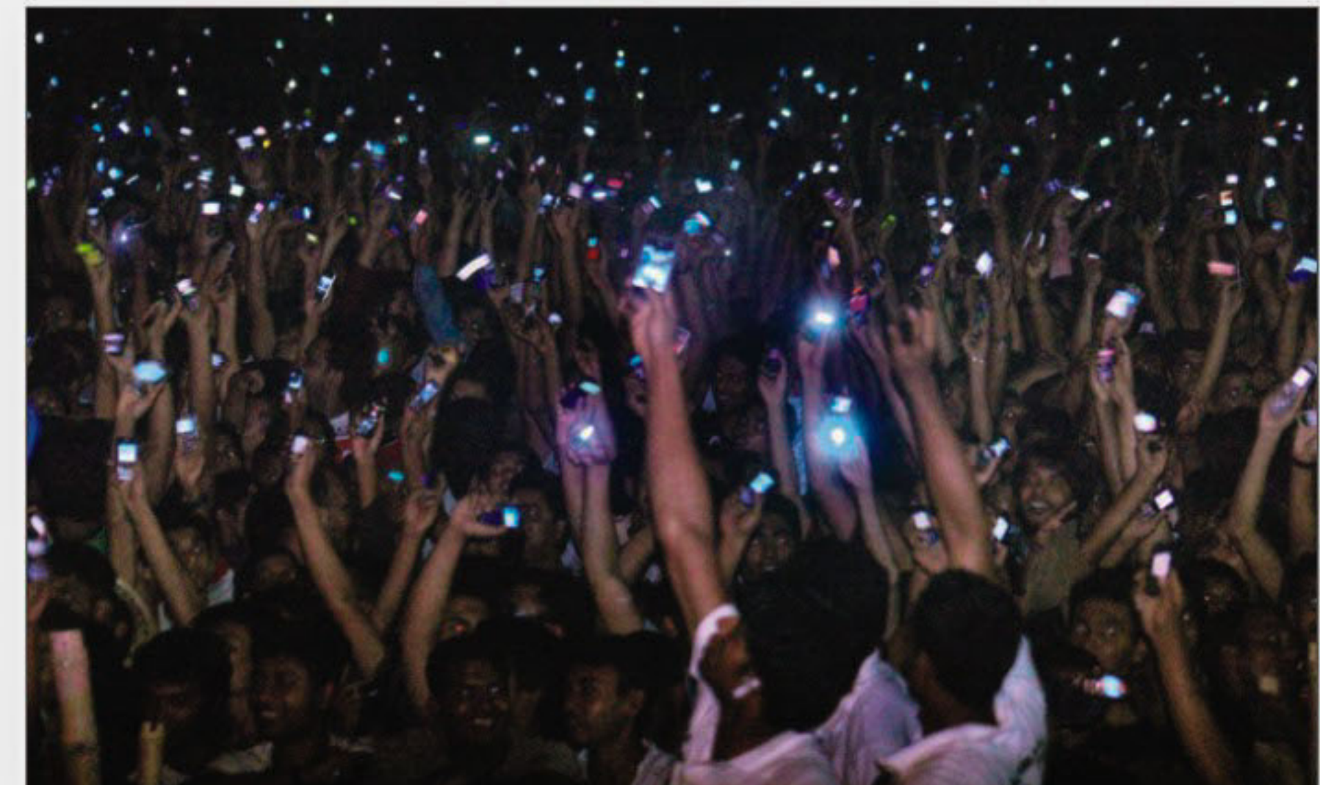
The young --- exploding in rhapsody.