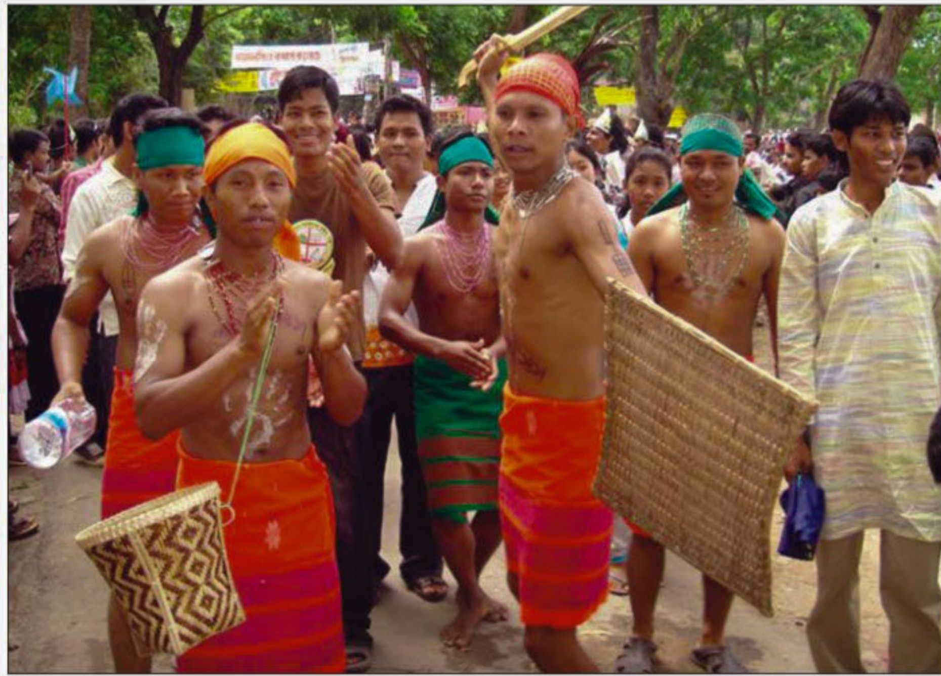
Indigenous artistes perform at the event.