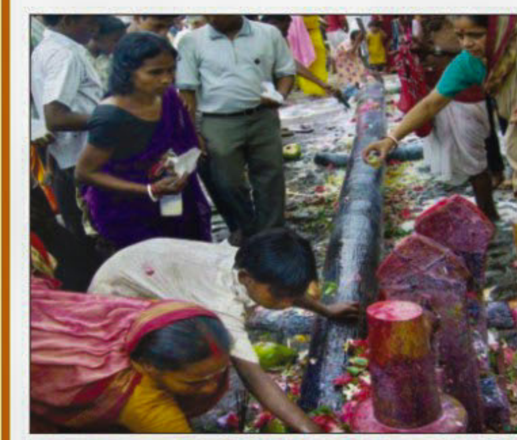
Devotees offer flowers and other items to the traditional Charak tree.

The programme featured a rally, mela (fair) donga (small boats made of palm tree) race, lathikhela , traditional games, kabigaan , jarigaan and an art competition for children. Several thousand enthusiastic visitors flocked to the venue everyday.