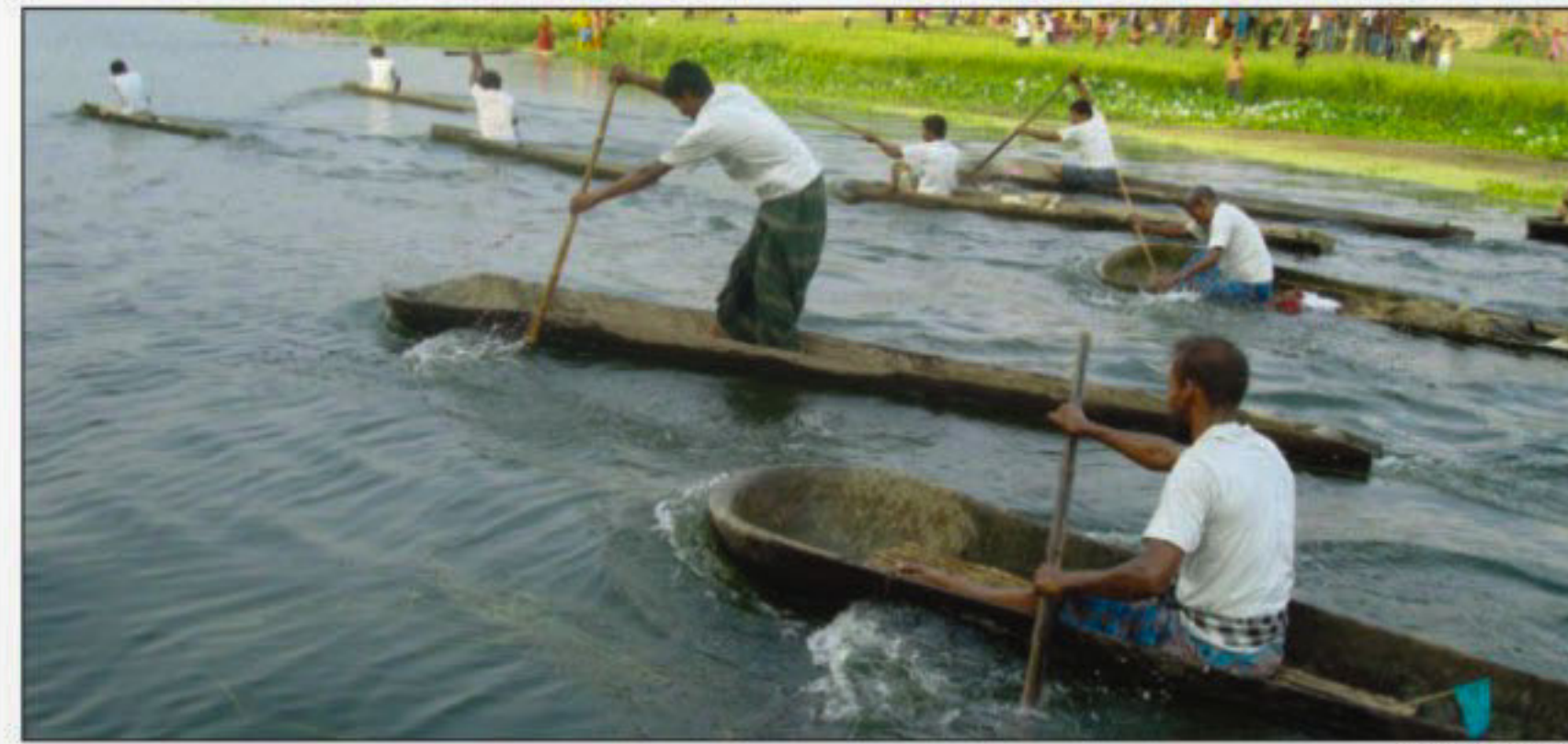
Riding the waves.