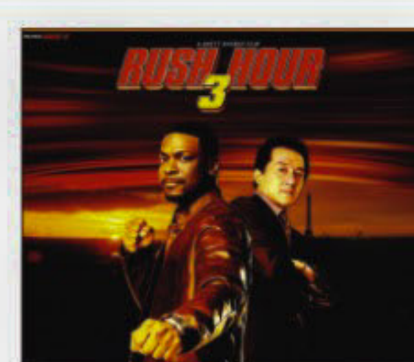
Rush Hour 3 On HBO at 9:30 pm Genre: Action Cast: Jackie Chan, Chris Tucker