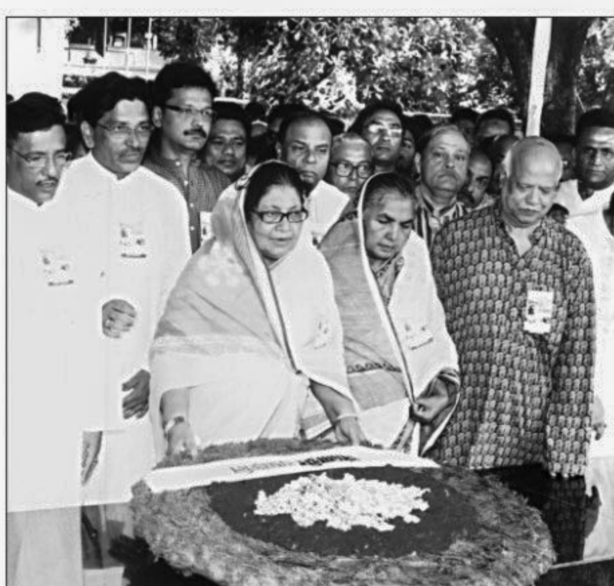
Deputy Leader of the House and Awami League Presidium Member Sayeda Sajeda Chowdhury along with party leaders places wreaths at the portrait of Bangabandhu Sheikh Mujibur Rahman at Dhanmondi in the city yesterday marking the Mujibnagar Day. (Story on Page 3)