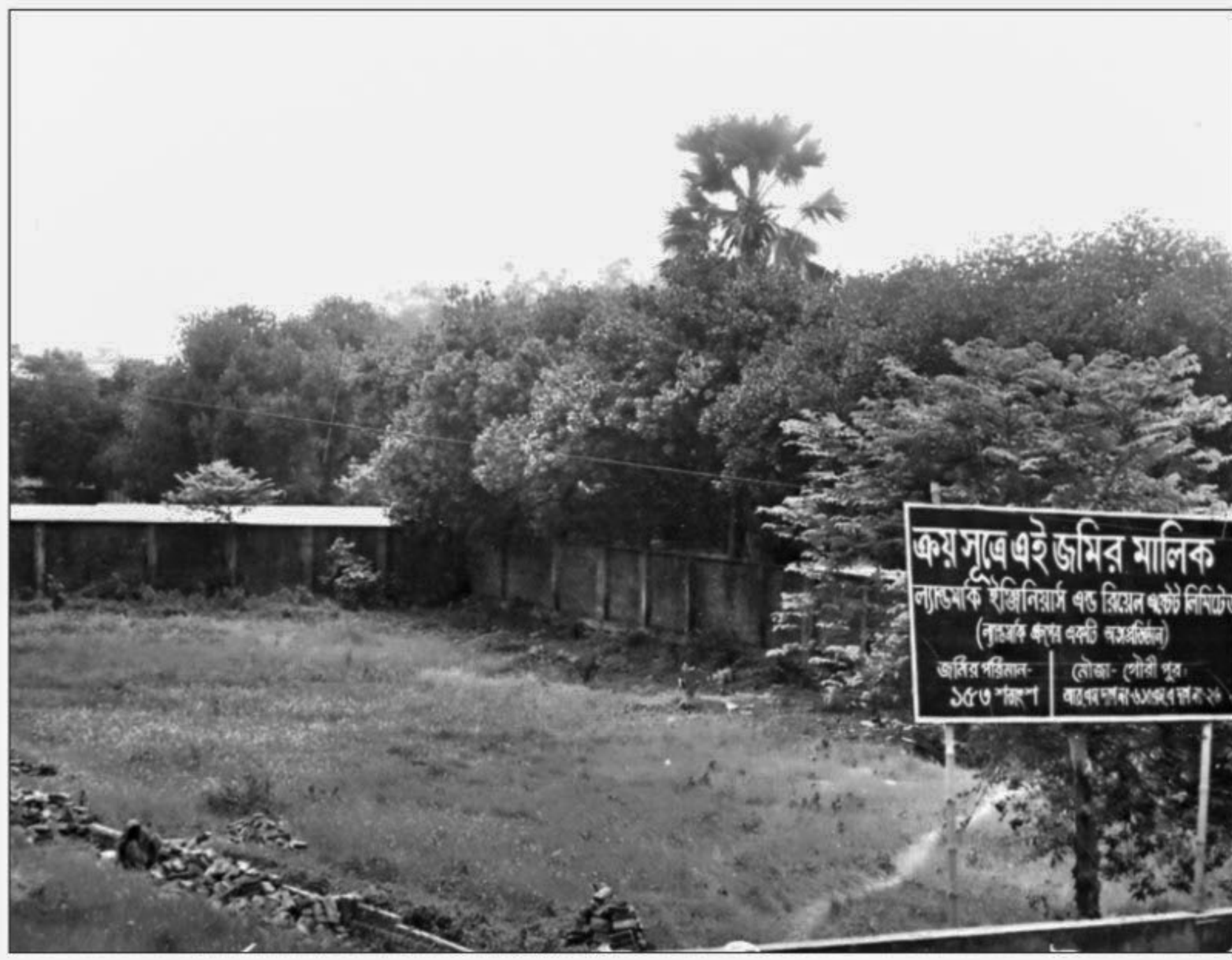
Hired men of Landmark Engineers and Real Estate Limited put up a signboard after allegedly occupying a land at Ashulia at dead of night on April 8.