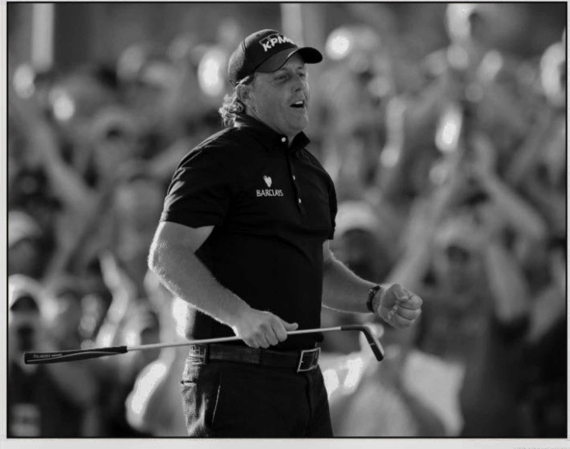
American Phil Mickelson celebrates after winning the Masters Tournament at the Augusta National Golf Club in Georgia on Sunday.

Clad in his traditional last-round red shirt, Woods finished the front nine with back-to-back birdies to stand on nine-under, three off Mickelson's lead.