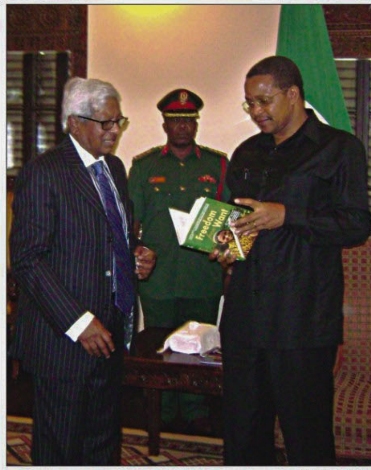
Tanzanian President Jakaya Kikwete thumbs through a book titled 'Freedom from Want', which chronicles the evolution of Brac, after Brac founder and Chairperson Fazle Hasan Abed presented it to him during a meeting at the president's palace in the Tanzanian capital of Dar es Salaam on Sunday.

quarter has been running a smear campaign saying that Islam would be destroyed if the policy is implemented. Nothing has been done to hurt the religious sentiments in the policy, he said, adding that they have tried to make madrasa education more developed and modern, as it has become a necessity.