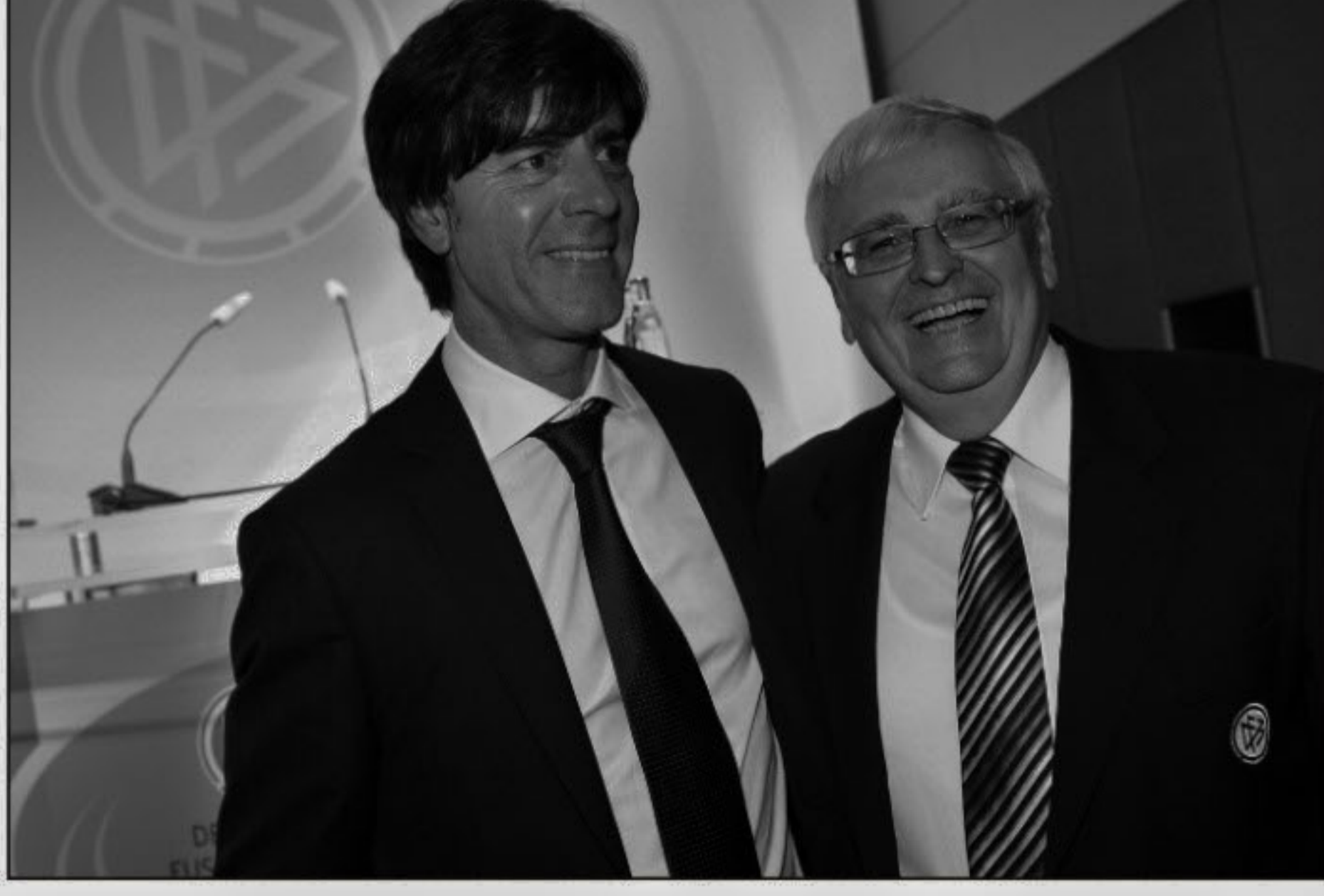
German football association president Theo Zwanziger (R) poses with national team coach Joachim Loew after a meeting in Frankfurt on Friday. Loew got a vote of confidence from Zwanziger for the upcoming 2010 World Cup in South Africa.

A spokesman for Essex said there would be no official comment from the club until the investigation was concluded. Essex Police were not prepared to name the players involved at this stage, nor reveal the exact nature of the allegations.