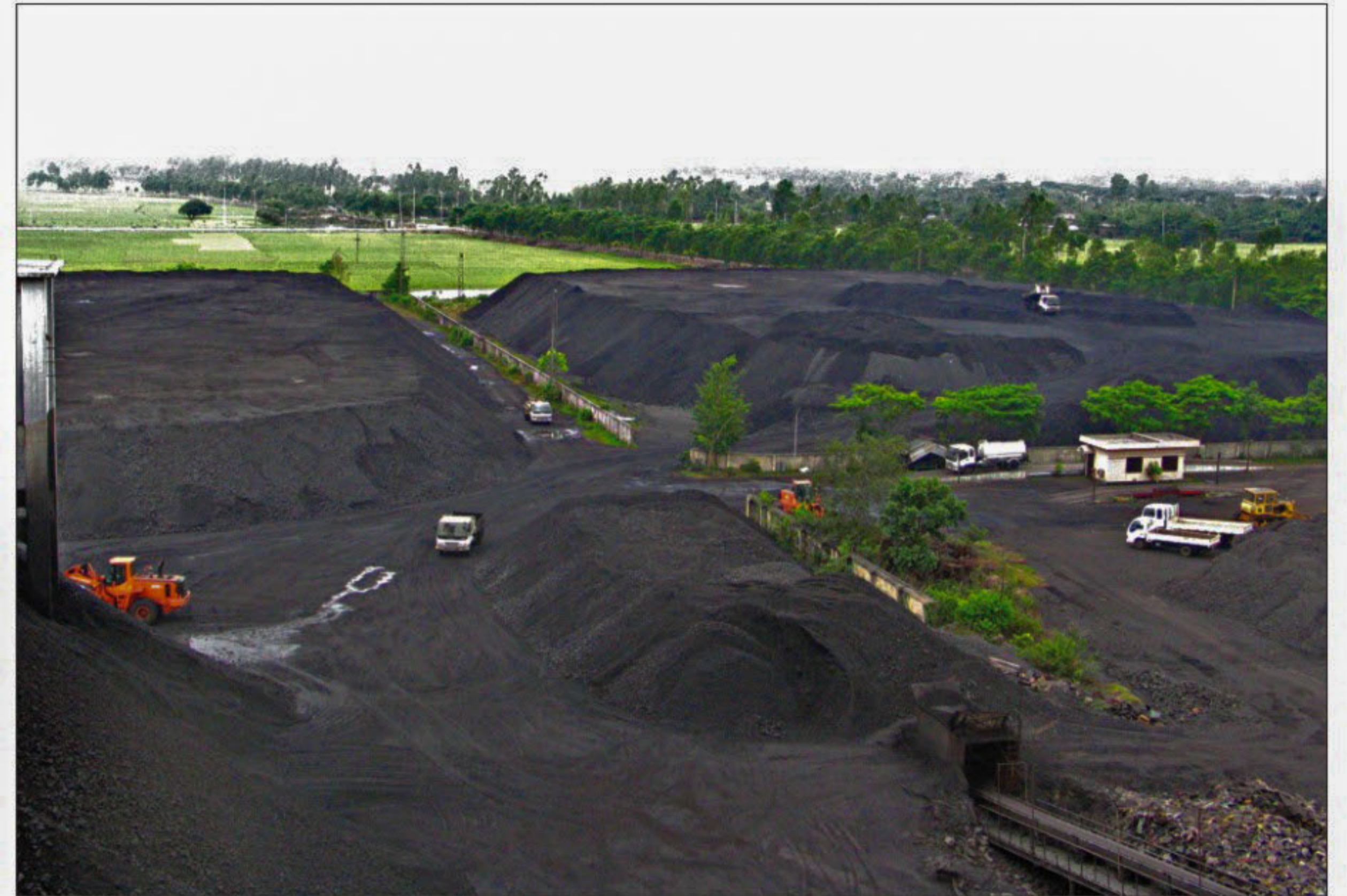
The Barapukuria coalmine's deposit is 389 million tonnes. Its current underground mining allows extraction of only 20 percent of the deposit. In many countries, up to 90 percent of coal deposit is extracted by implementing the open-pit mining.