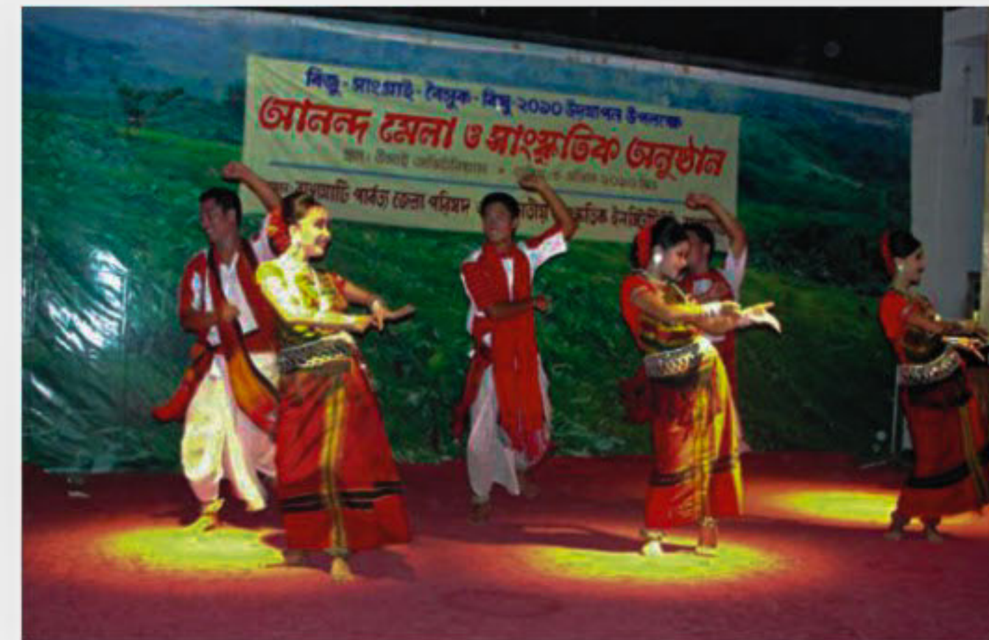
Ethnic people observe 'Bijhu Utsab'.

The recent violence at Baghaihat and Khagrachhari has cast a cloud on the Bijhu festival. Hundreds of indigenous families who are victims in those areas have boycotted the festival in a gesture of protest against the attacks on ethnic people by Bengali settlers.