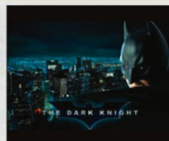
The Dark Knight On HBO at 9:30 pm Genre: Action/ Thriller Cast: Christian Bale, Heath Ledger