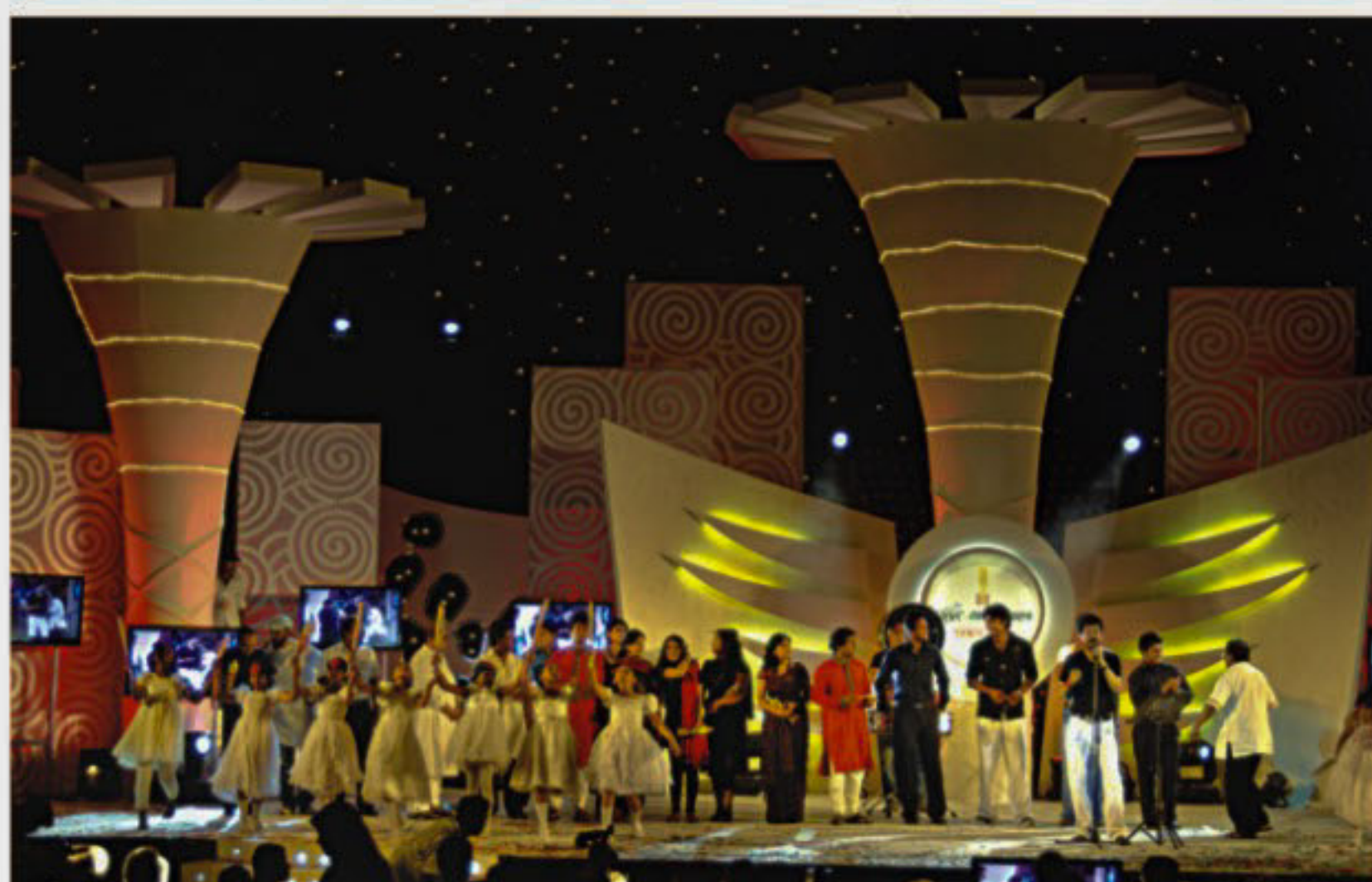
Celebrating the leading lights of culture.