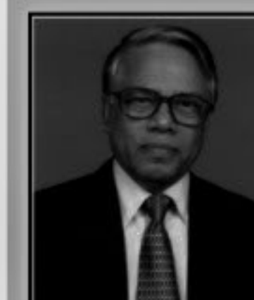
Nurul Islam Nahid M.P. Minister

I heartily congratulate the students who are being awarded with the well-deserved degrees, the parents, the Vice Chancellor and her team on this auspicious accession.