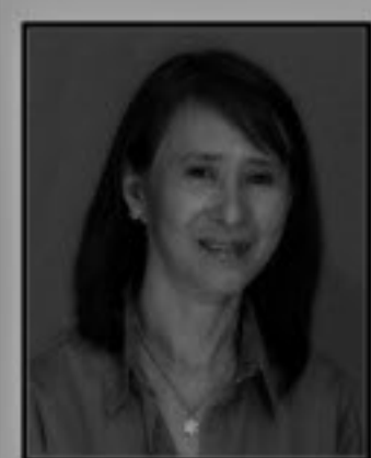
Md. Zillur Rahman

Khoda Hafez, May Bangladesh Live Forever.