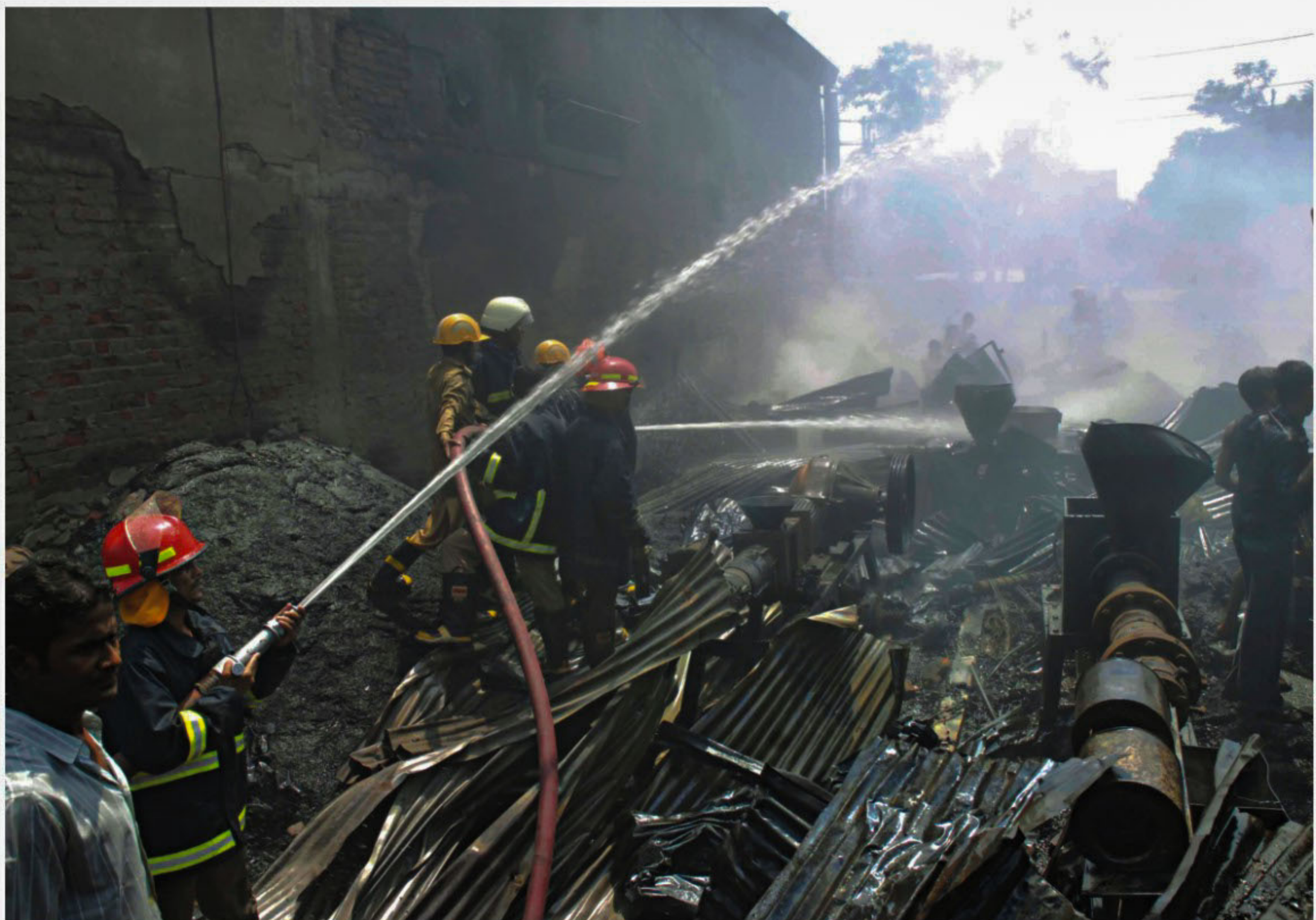
Firefighters douse smouldering remains after an arson attack on at least 20 business establishments at Loharpool Dhal of Kamrangirchar yesterday. Several other business establishments were looted by the attackers.