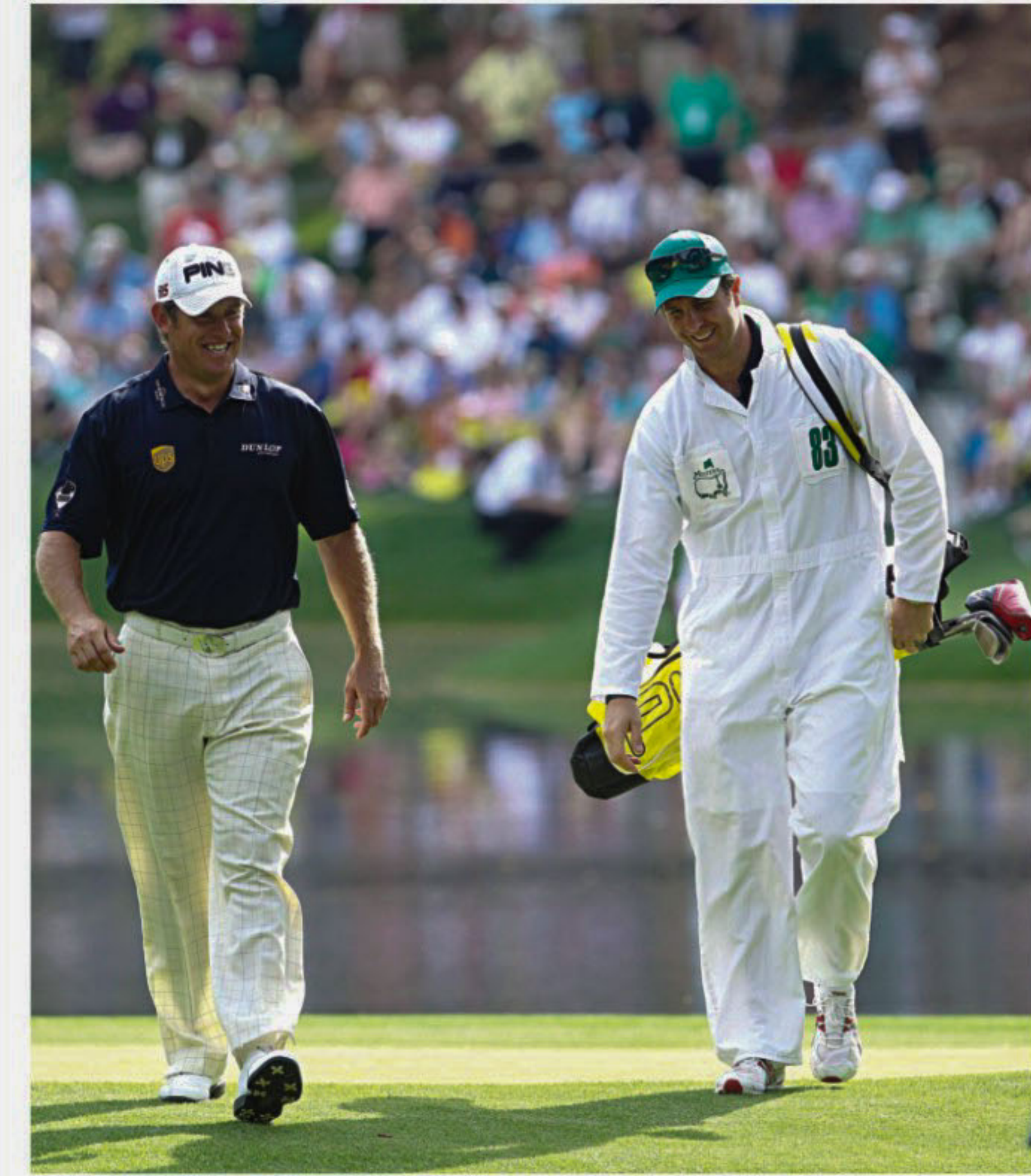
Former England cricket captain Michael Vaughan (R) has assumed a new role, caddie for England golfer Lee Westwood (L) at the Augusta Masters. The two have a light chat during Par 3 prior to the 2010 Masters at Augusta National Golf Club in Georgia on Wednesday.

That assessment should at least ease the concerns of England manager Fabio Capello, who was at Old Trafford, with Ferguson adamant the correct procedures had been followed.