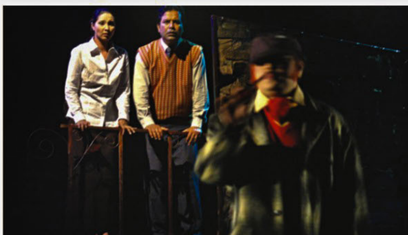
Actors of Padatik in the murder mystery "Mousetrap".