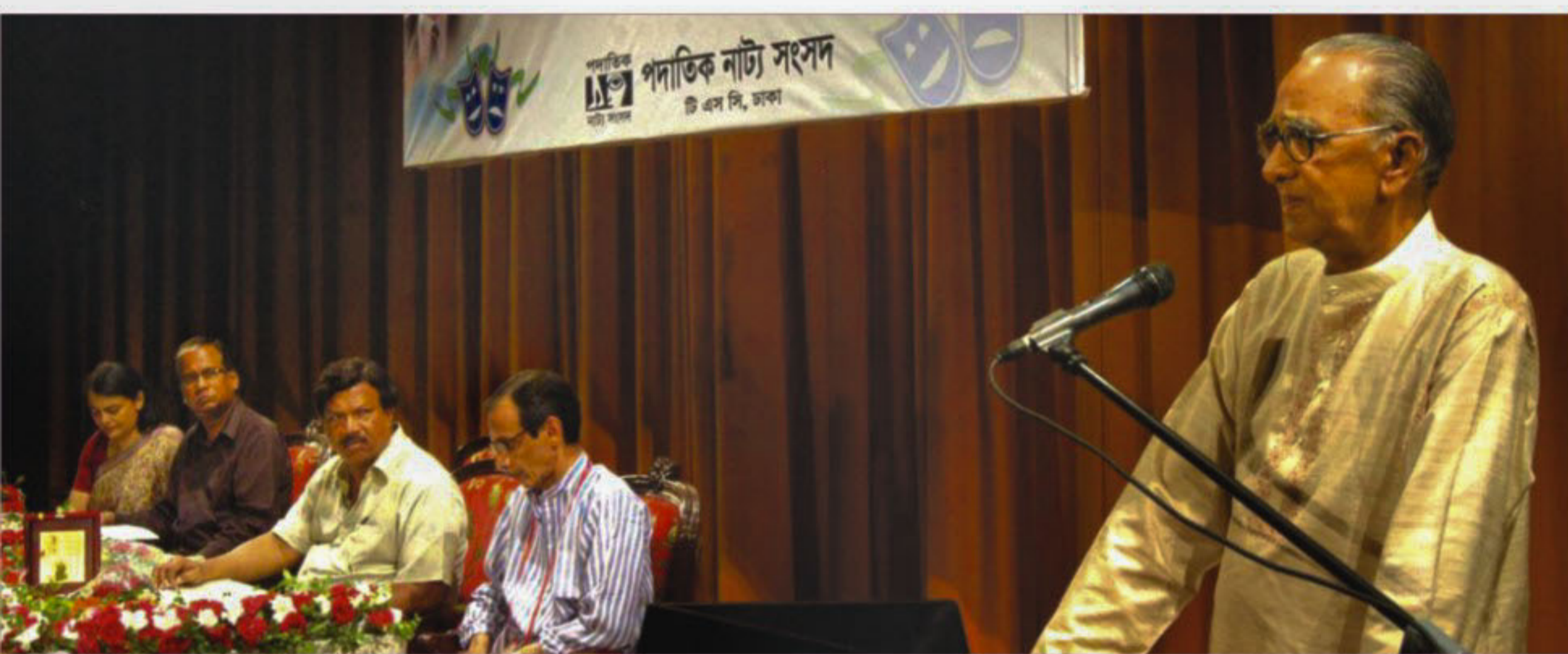
Former Chief Justice Muhammad Habibur Rahman speaks at the inauguration.

Today, Theatre Workshop will stage "Jodio Galpo".