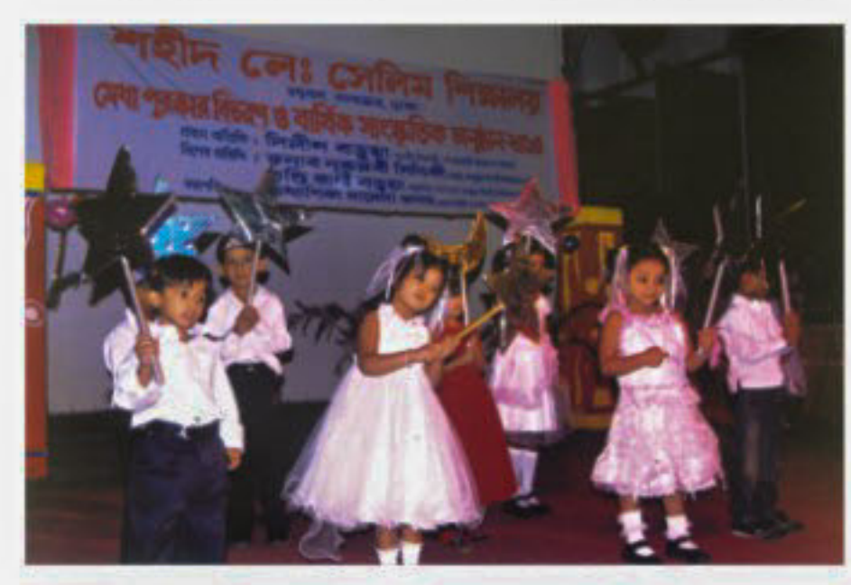
Students perform at the event.