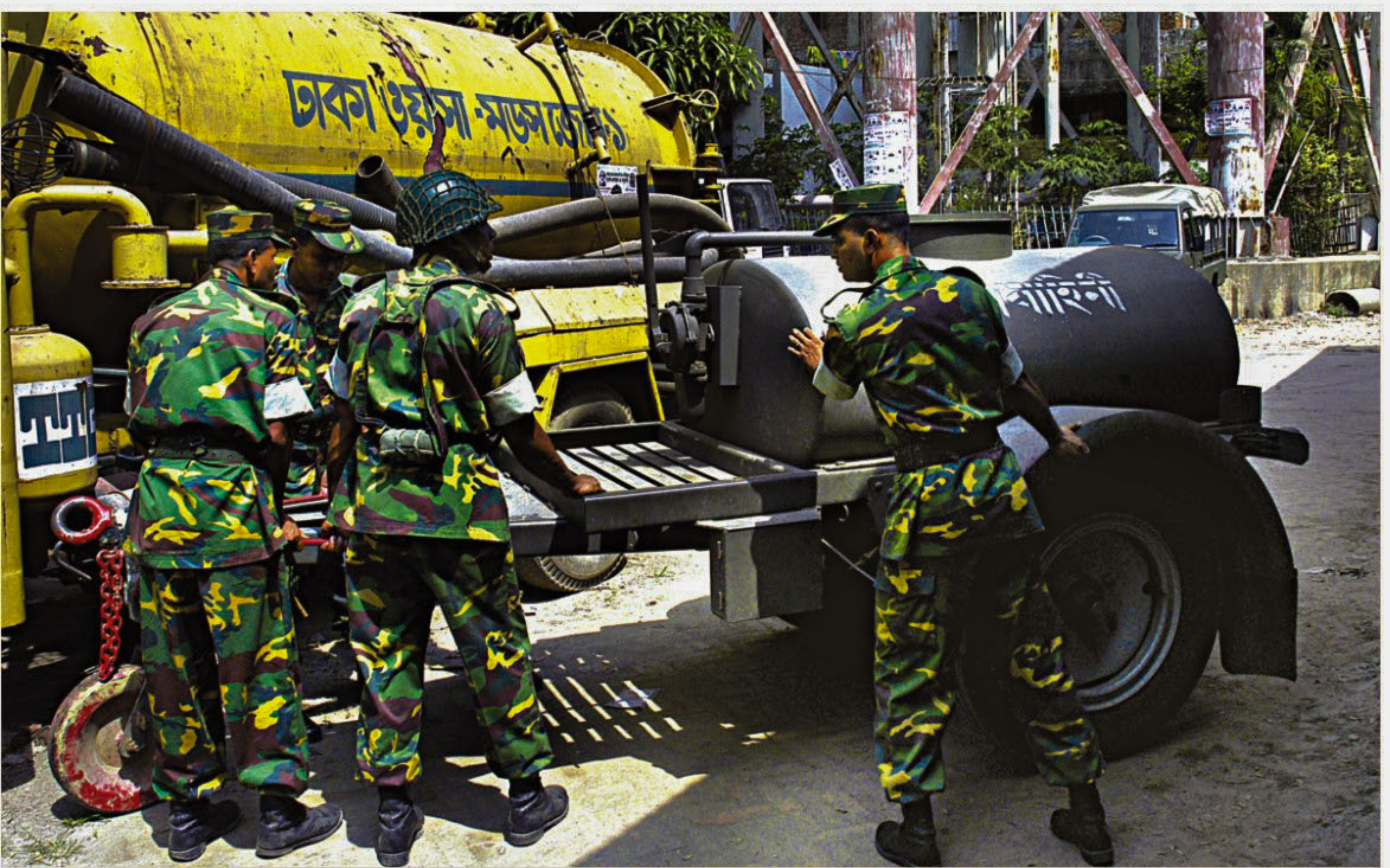
Army personnel prepare water trucks for rolling out at Fakirapool Water Tank, after being deployed yesterday morning to help Dhaka Wasa in easing the acute water crisis in the capital.