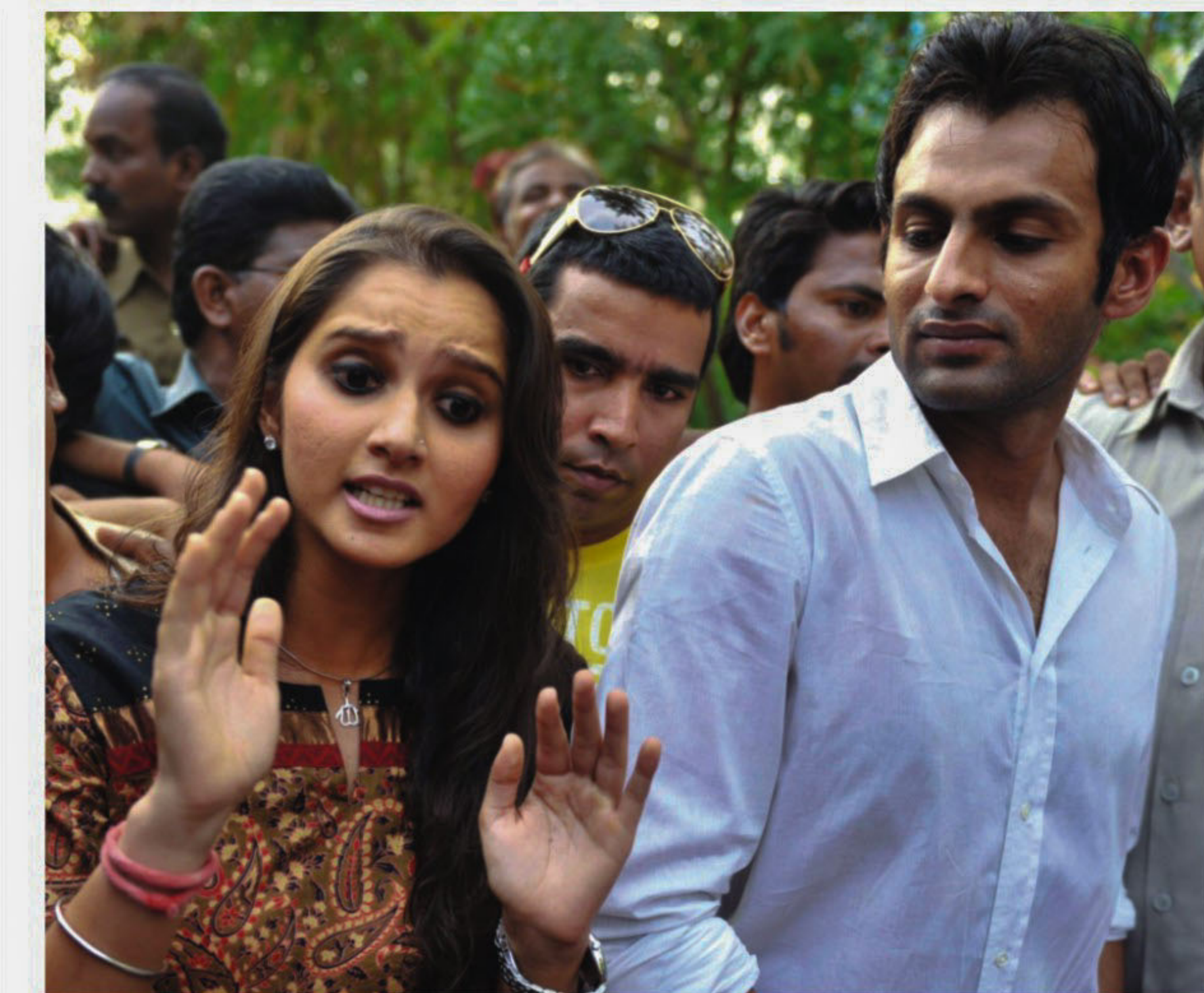
I'M WITH SHOAB: Indian tennis star Sania Mirza, standing next to her would-be husband Pakistani cricketer Shoaib Malik, makes a point to media outside her residence at Banjara Hills in Hyderabad yesterday.

Club Cup Hockey Mohammedan v Mariners Time: 2:30pm Abahani v Ajax Time: 4:00pm Venue: Maulan Bhasani Hockey Stadium