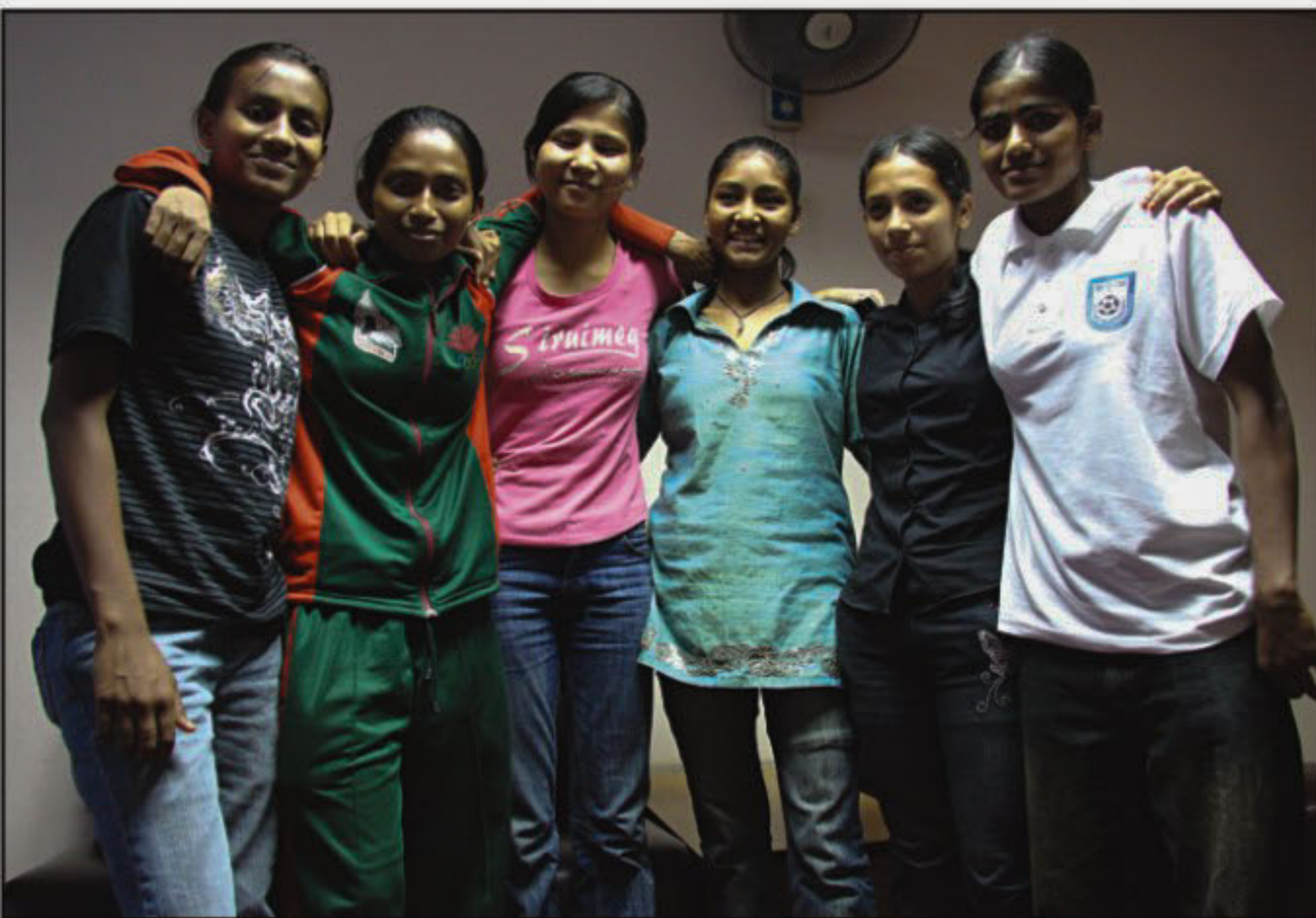
PHOTO: STAR Six female booters from the district level pose for photos following their interview at the American Embassy yesterday. The six along with six other male booters are scheduled to leave for the United States on April 12 for a two-week training tour on the invitation of the American State Department.

The game's governing body SEE PAGE 18 COL 5