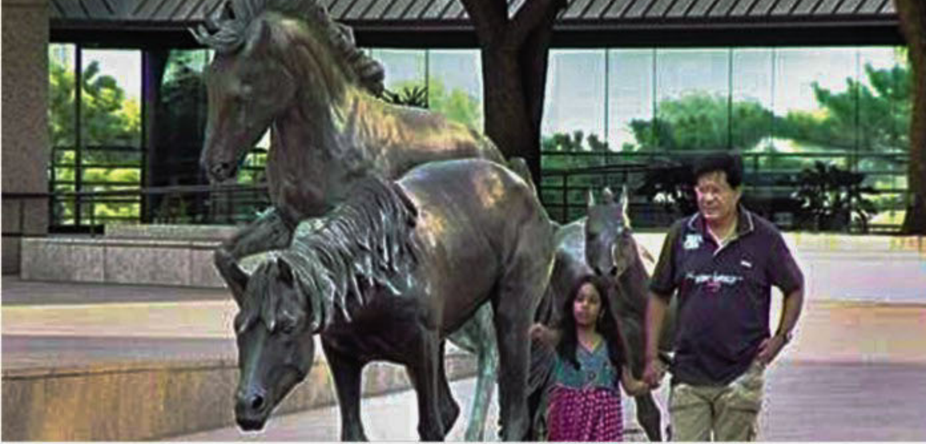
A scene from the TV play.